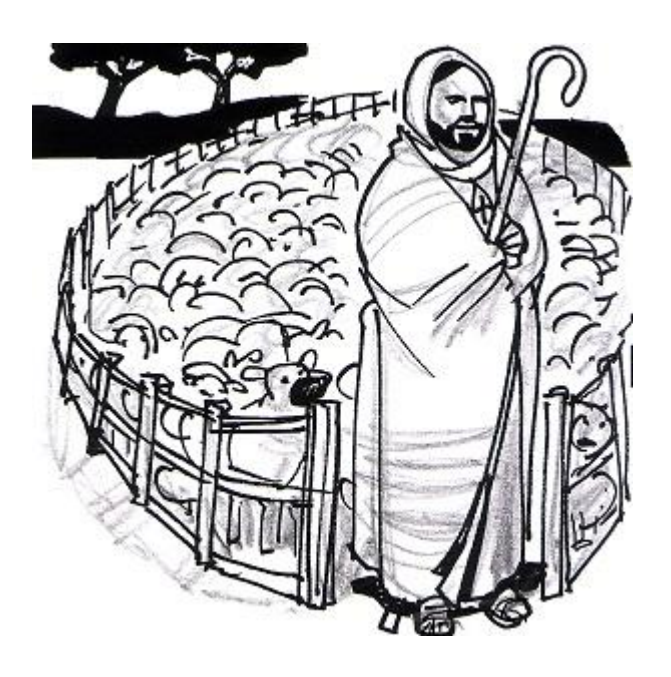
"I am the good shepherd" (John 10:11).