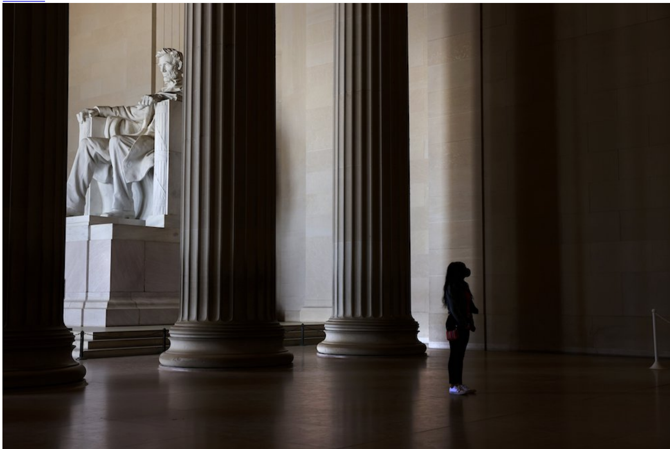
A visitor in the Lincoln Memorial in Washington April 21, 2021