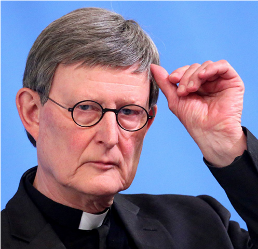
Cardinal Rainer Maria Woelki of Cologne, Germany