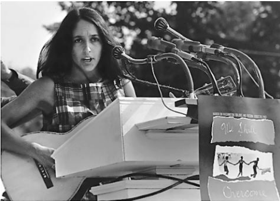
Vocalist Joan Baez performs at a civil rights march on Aug. 28, 1963, in Washington, D.C.

While in Washington then, she took time to speak to my peace studies classes at American University. I had arranged for her to give a free outdoor concert on the quad in the early afternoon, and then come to speak and exchange ideas for two and half hours with my students. The year before, she hosted a post-concert seminar at Constitution Hall for 40 of my students from The School Without Walls , which, by the way, is the closest school to the Kennedy Center. At least two dozen times over the years, Baez has supplied free tickets and backstage passes to my high school and college students.