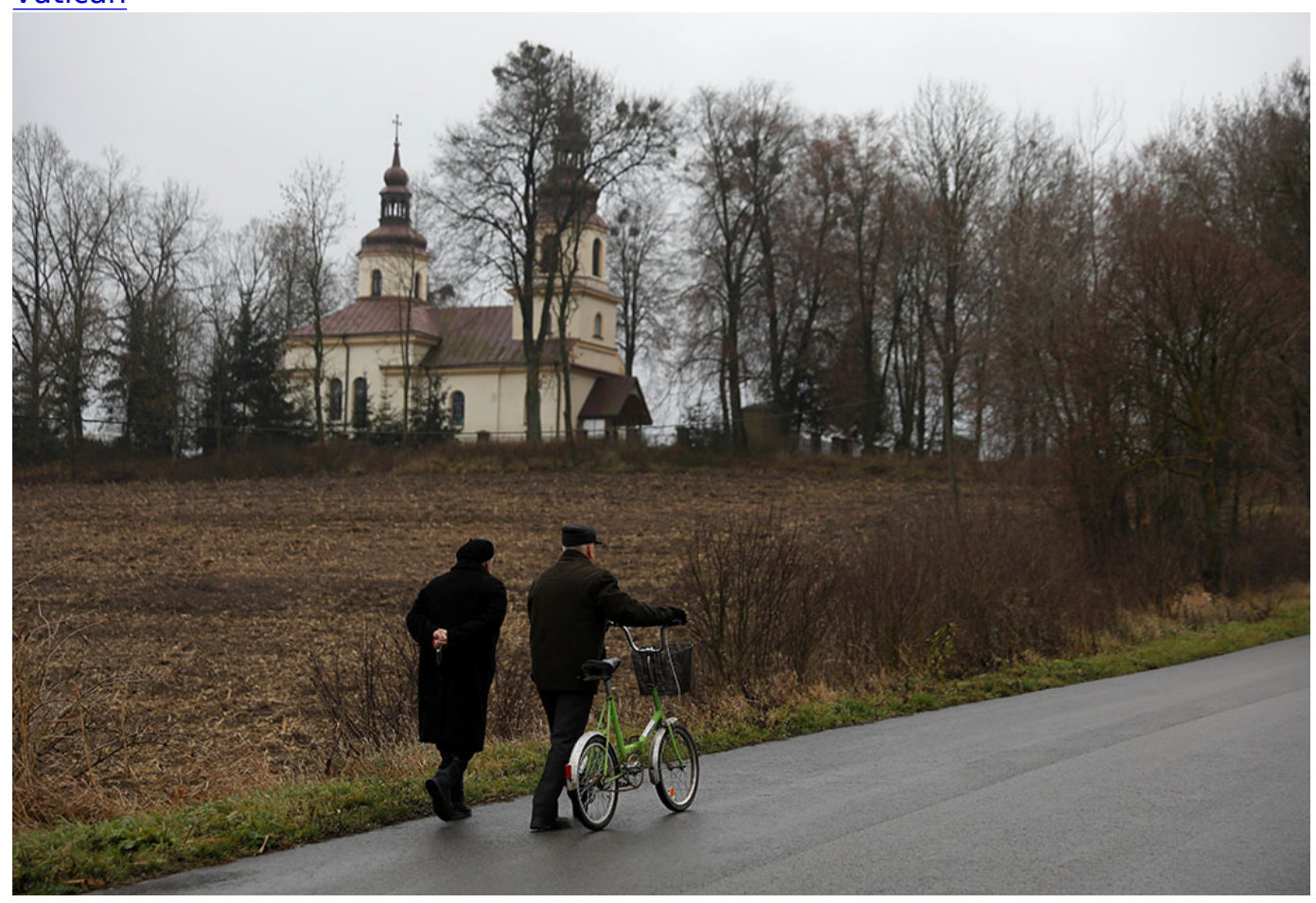
People in Kalinowka, Poland, walk to Mass in a file photo.