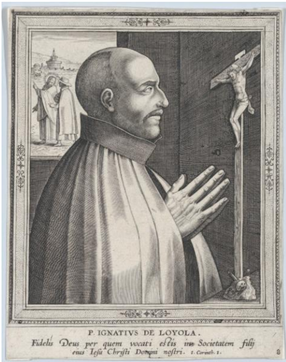
St. Ignatius of Loyola, designed by Philips Galle