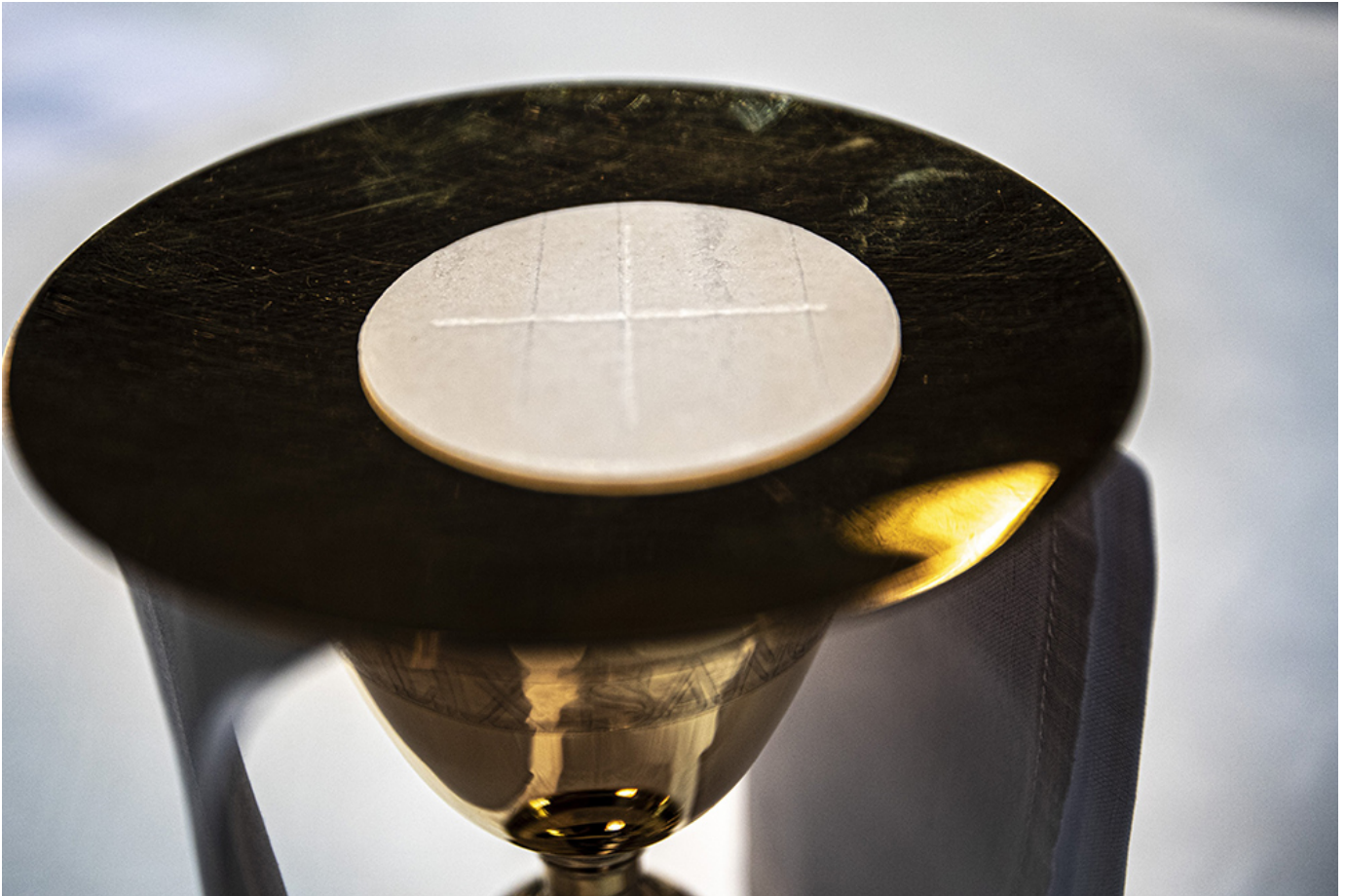
The Eucharist rests on a paten on an altar in a cathedral.