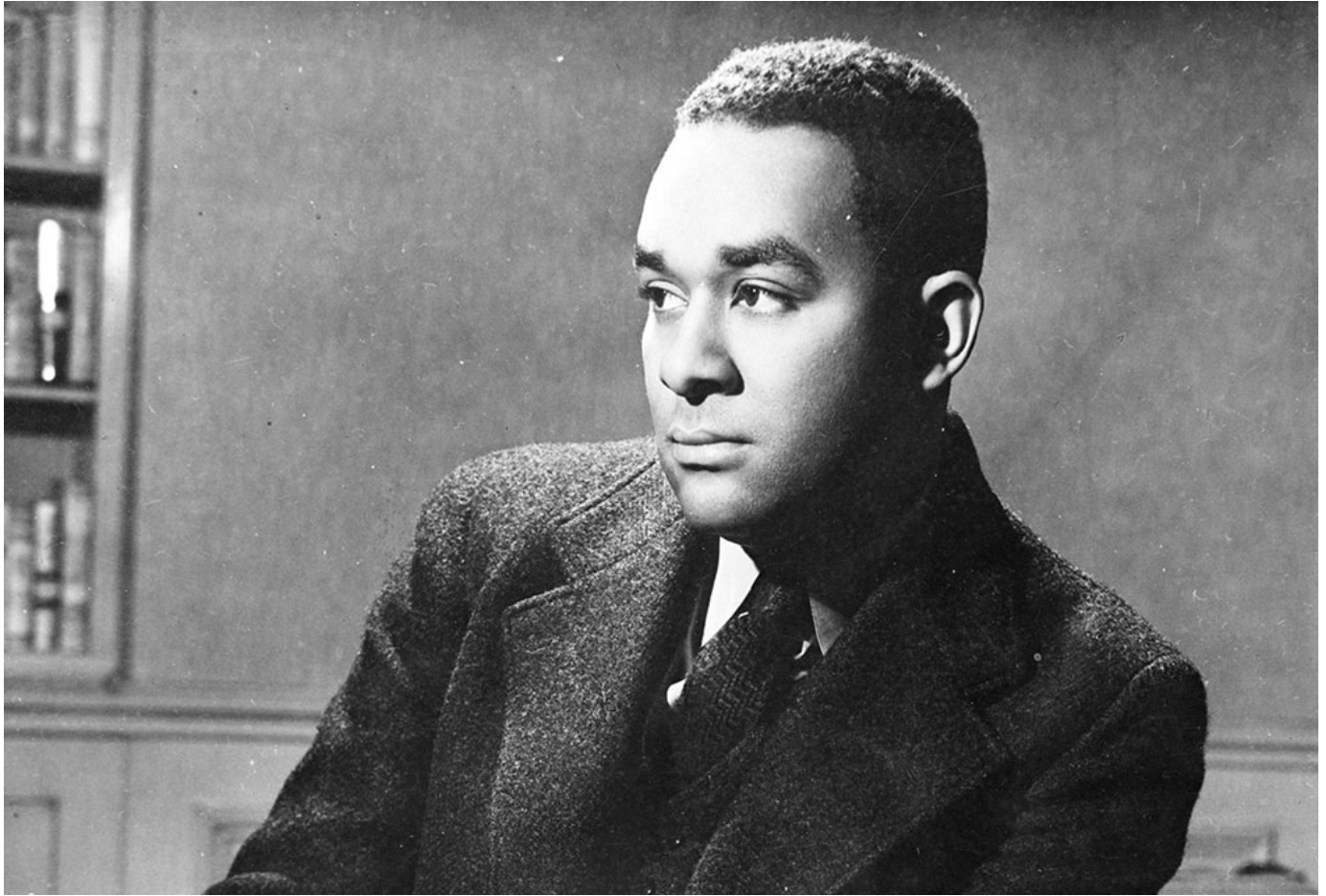
Novelist Richard Wright, circa 1935-42