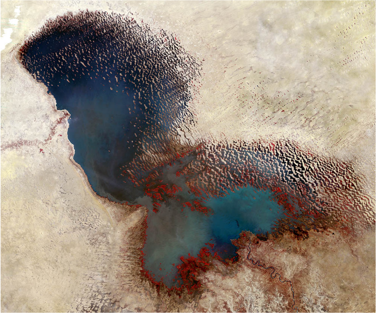
Lake Chad in 1973: Africa's Lake Chad was once an important source of fish and of water for farming for people in Chad, Cameroon and Nigeria.