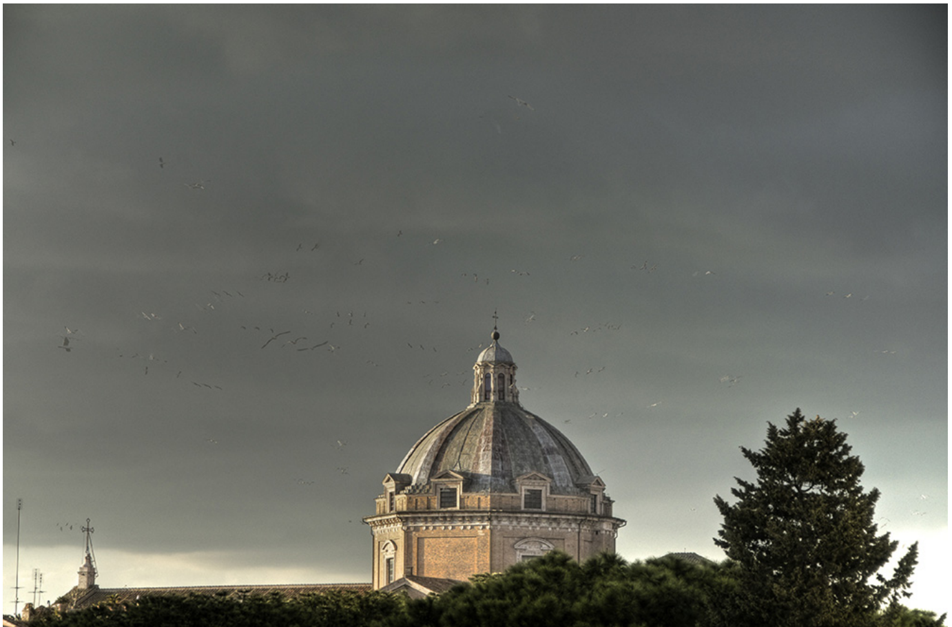
The dome of the Church of the Gesù, the mother church of the Society of Jesus in Rome