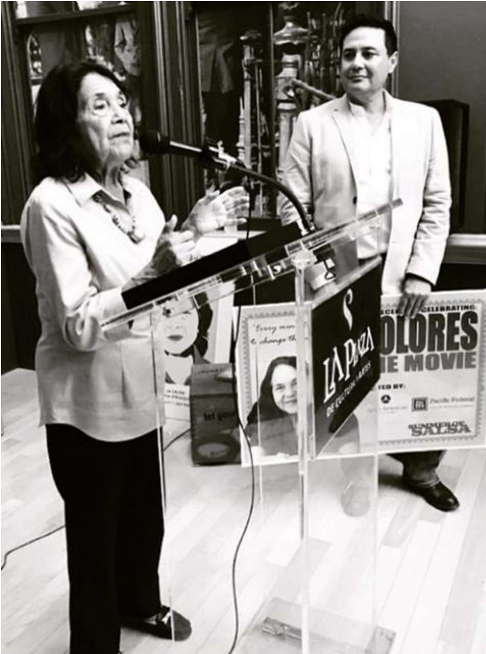
David Damian Figueroa watches as Dolores Huerta addresses the crowd at the pre-reception for the premiere of the documentary "Dolores."

Today, farmworkers are facing even more extreme heat conditions, with temperatures approaching 120 degrees in some areas.