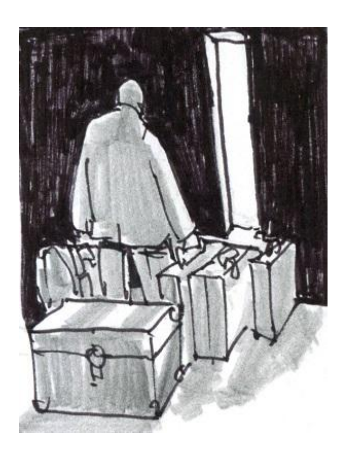
"Who then can be saved?" (Matthew 19:26).