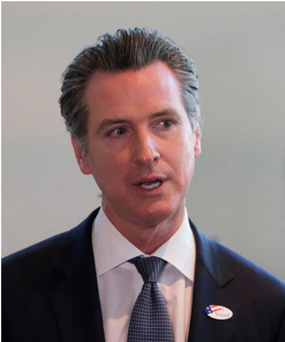
California Gov. Gavin Newsom