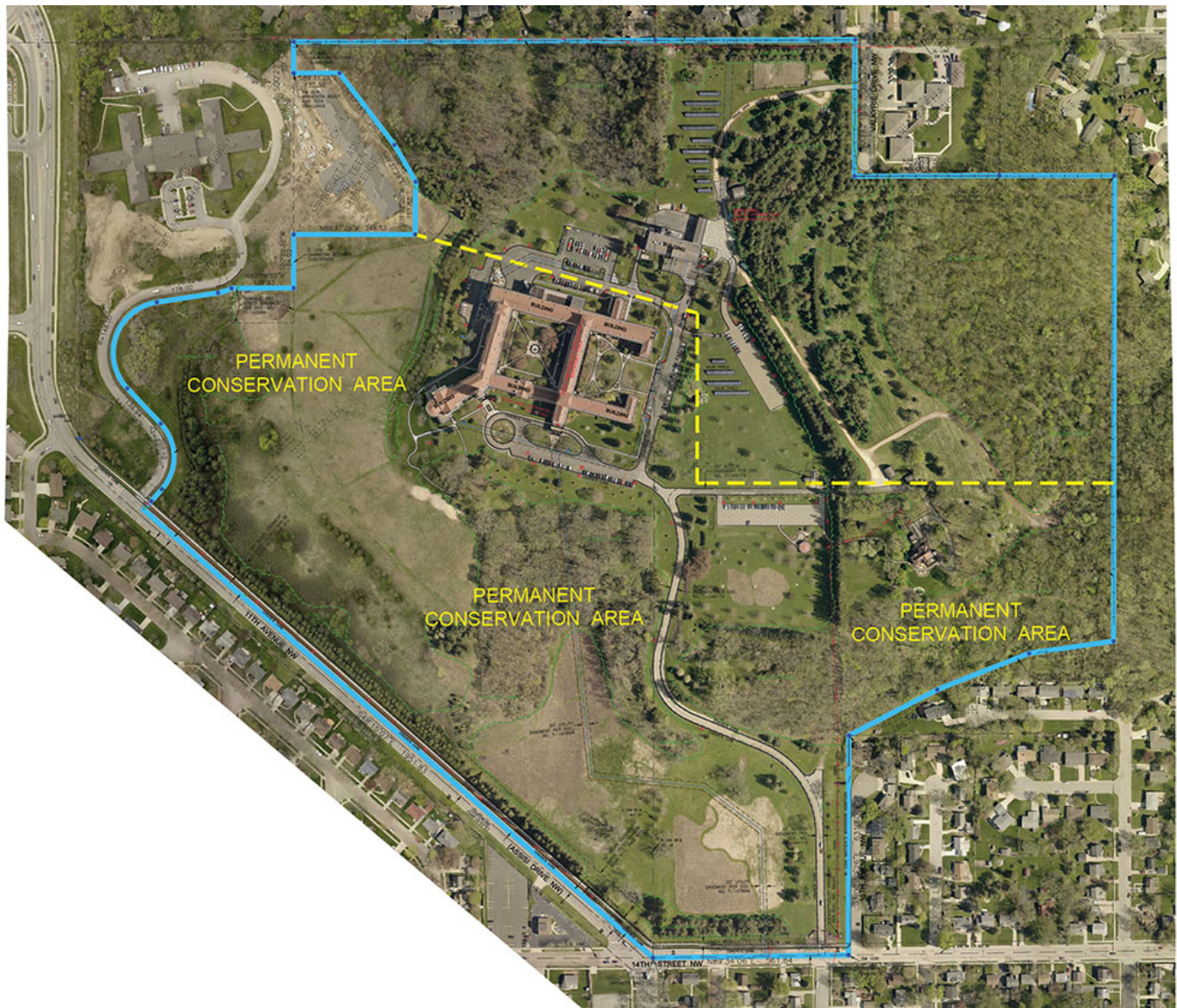
Map of the Sisters of St. Francis motherhouse, Assisi Heights and the conservation easement