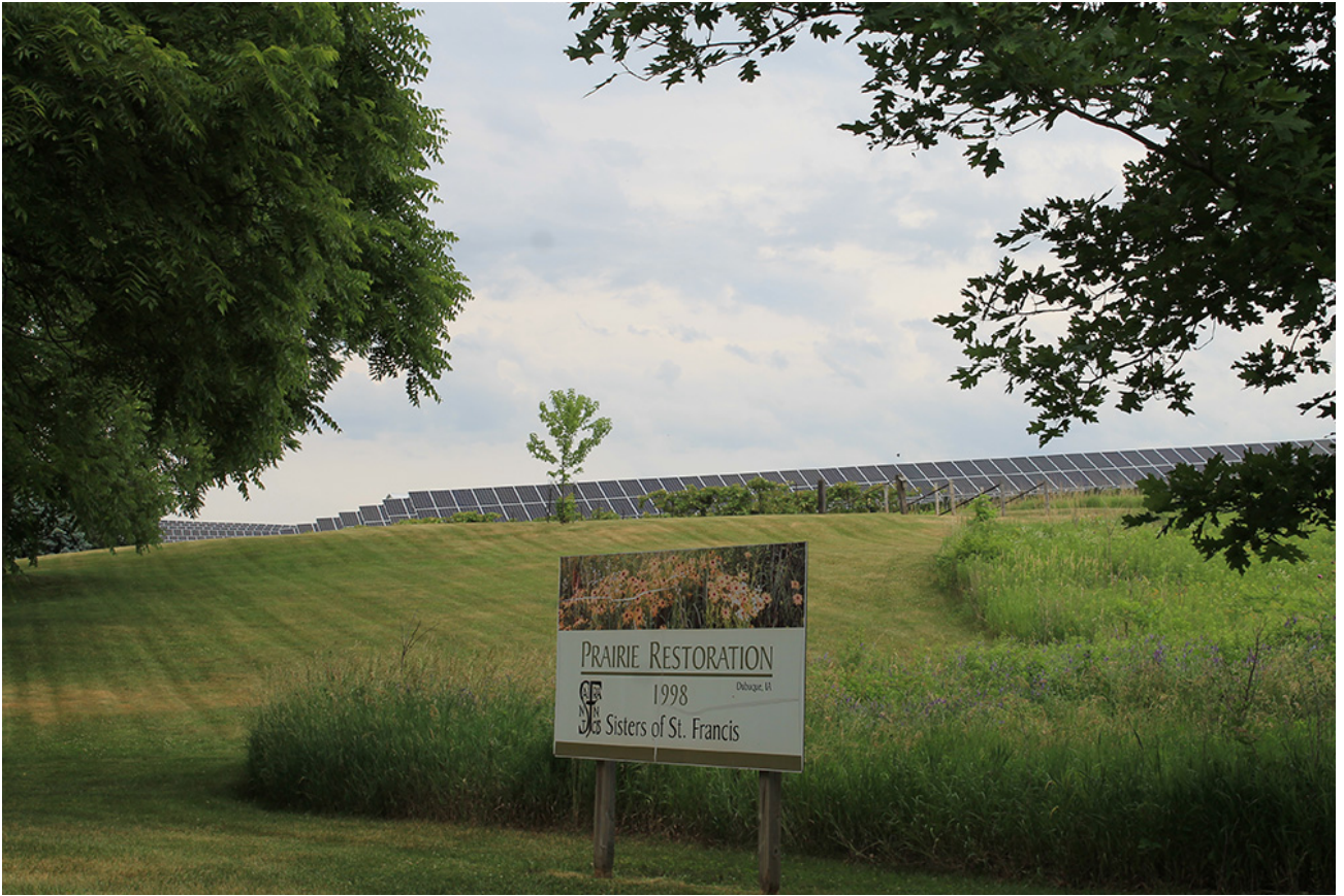
An array of 2,600 solar panels in the background of a restored prairie area at the motherhouse of the Sisters of St. Francis, in Dubuque, Iowa.