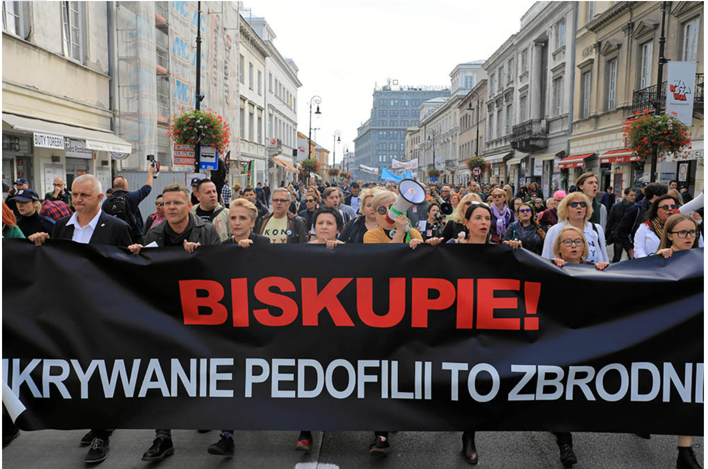
People take part during a demonstration against pedophilia, "Hands away from children," in Warsaw, Poland, Oct. 7, 2018. The banner reads, "Bishop, hiding pedophilia is a crime."