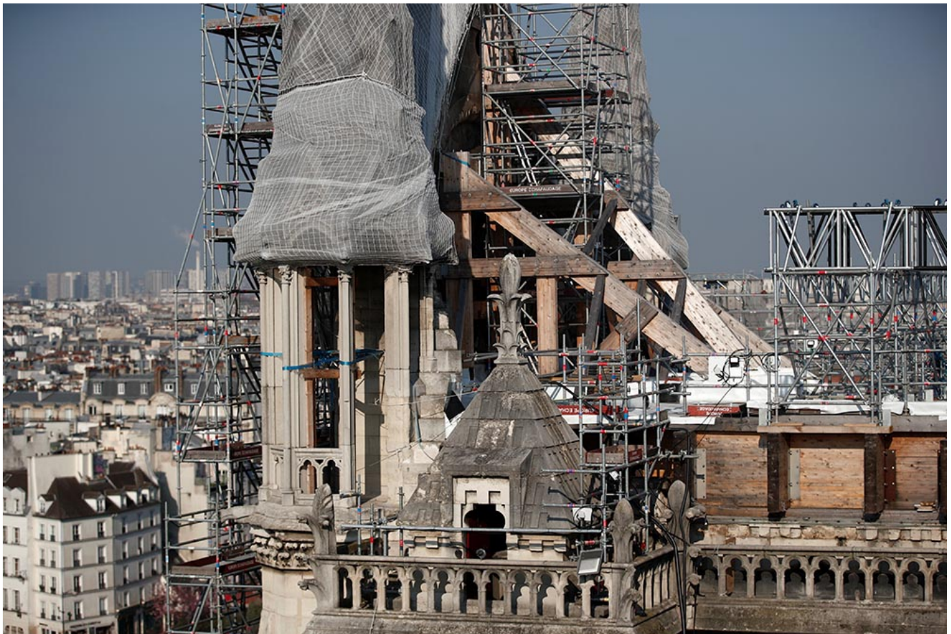
Scaffolding surrounds the damaged Notre Dame Cathedral April 15 in Paris.

As the burnt embers are cleared away and the great Notre Dame Cathedral is restored and rebuilt, let us find in that challenging but determined work the hope and the strength to open wide the doors of the church as a place for all of humanity to find refuge, to find healing, to find mercy in the one Body of Christ.