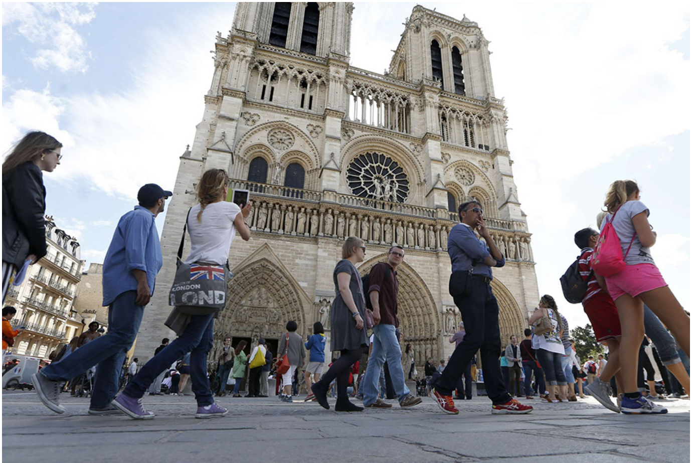
People stand in line outside Notre Dame Cathedral Aug. 22, 2014, in Paris.

The last person in line, a young woman, moved forward slowly and extended her hands. The priest exchanged some words with her, covered the ciborium with the palm of his hand and slightly shook his head, turning his back to return to the altar. The shock of it was as if he had slapped her. The woman, with head down and tears streaming, quickly walked past me.