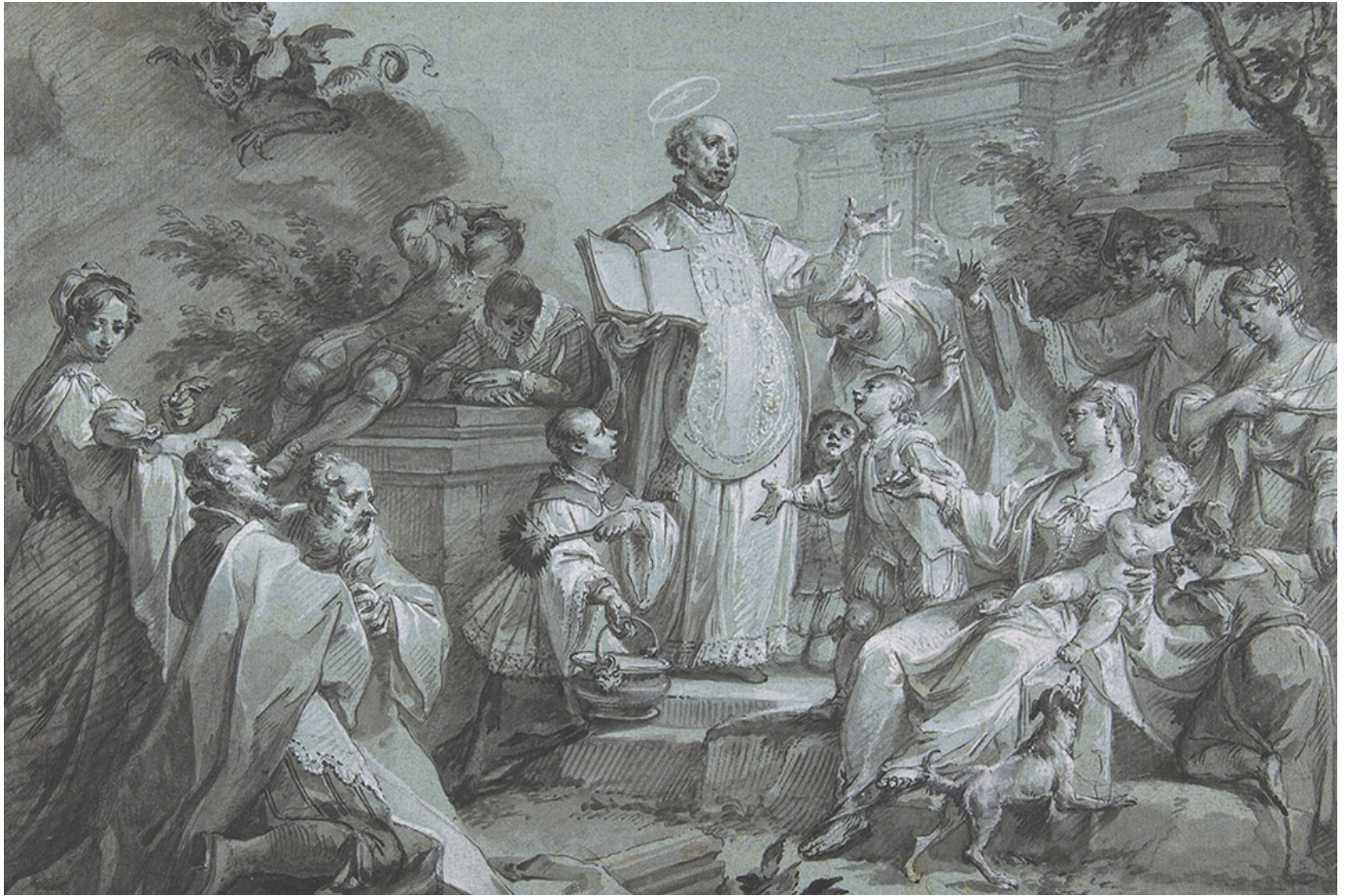
"Saint Ignatius of Loyola Preaching," by Johann Wolfgang Baumgartner, a drawing in ink dated before 1761 (Metropolitan Museum of Art)