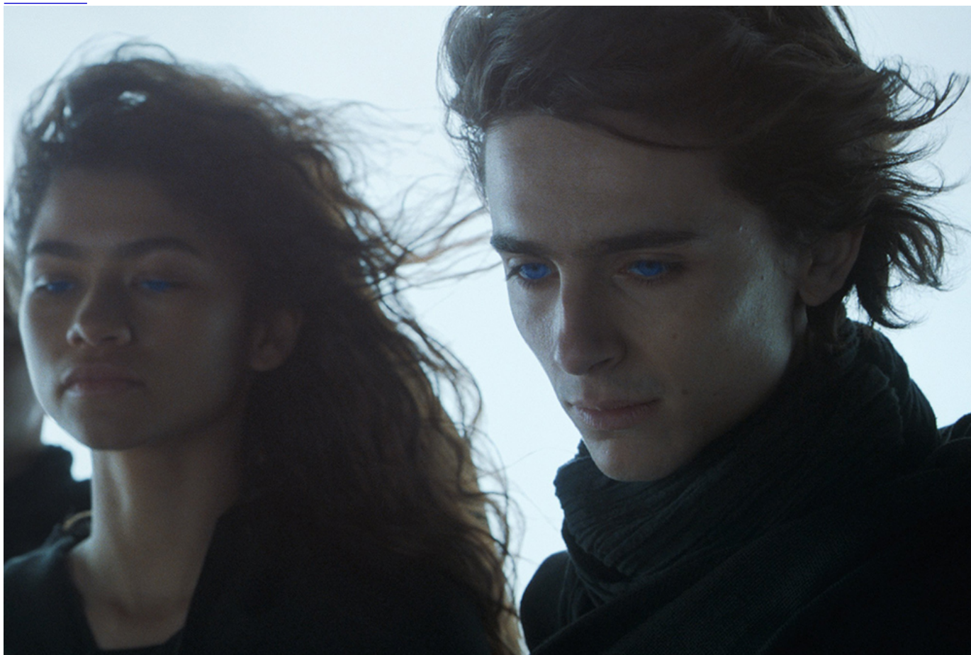
Zendaya and Timothée Chalamet star in a scene from the movie "Dune."