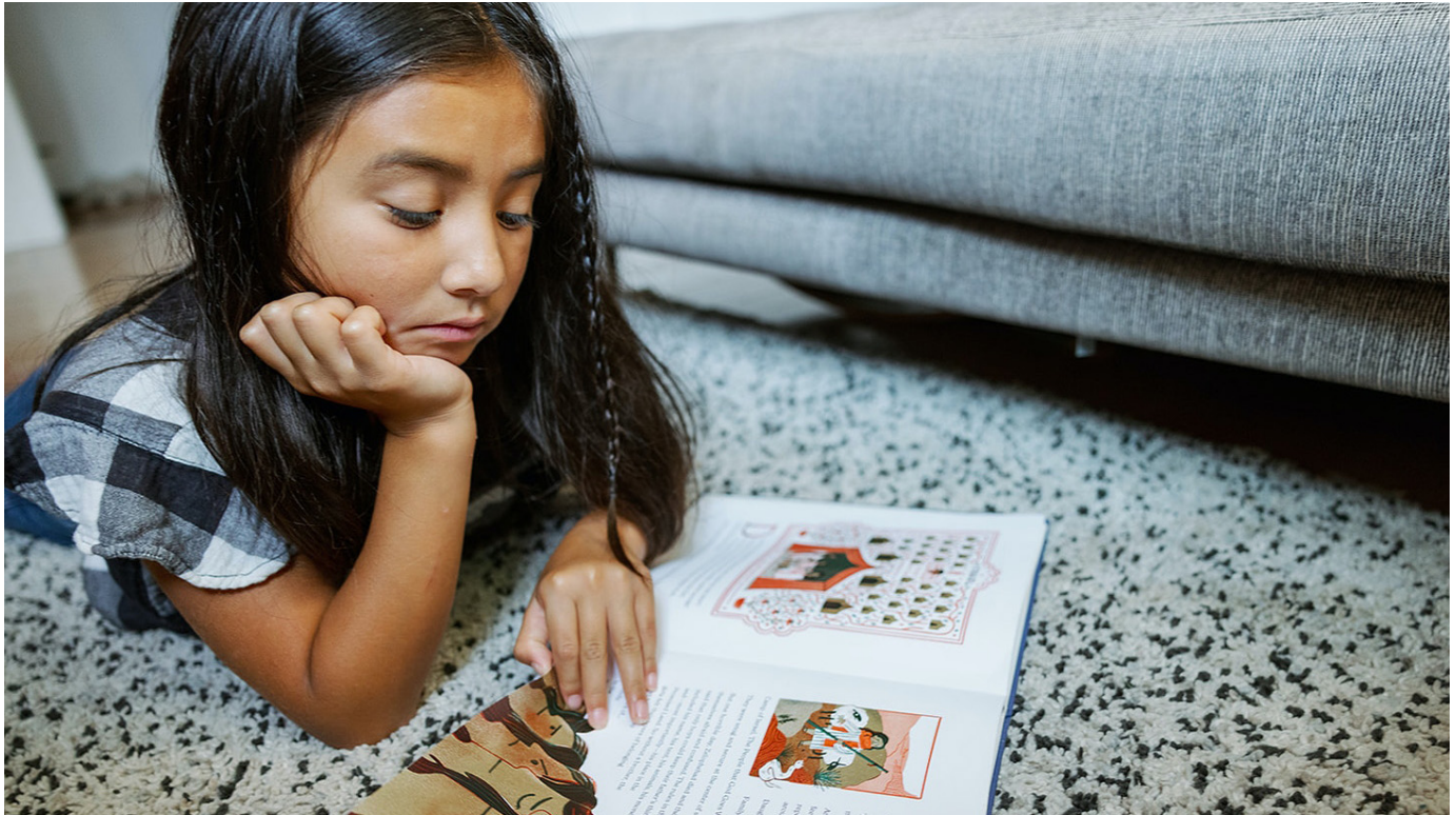
A child reads a sample of "The Book of Belonging."