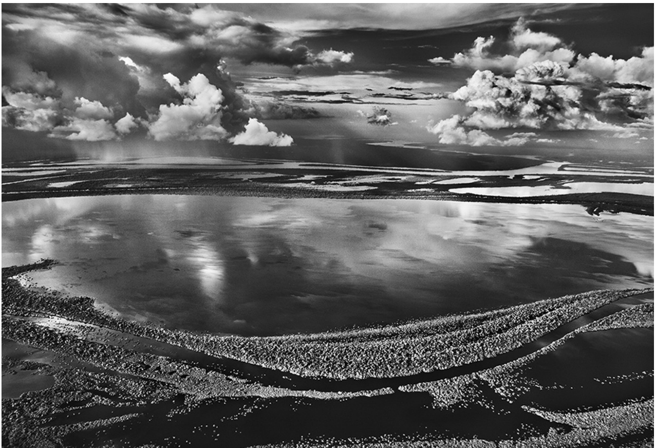
Anavilhanas, forest islands of the Rio Negro, in 2009 in Amazonas state, Brazil