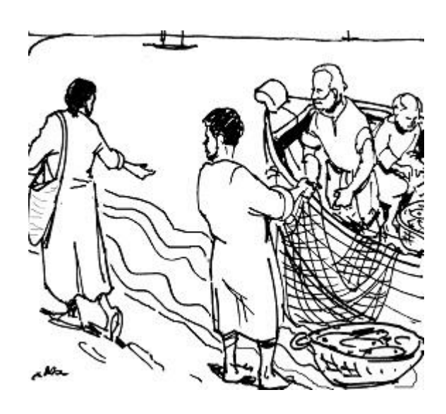
"This is the time of fulfillment. The Kingdom of God is at hand" (Mark 1:15).