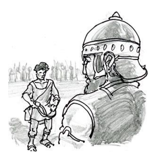
"Go, the Lord will be with you" (1 Samuel 17:35).