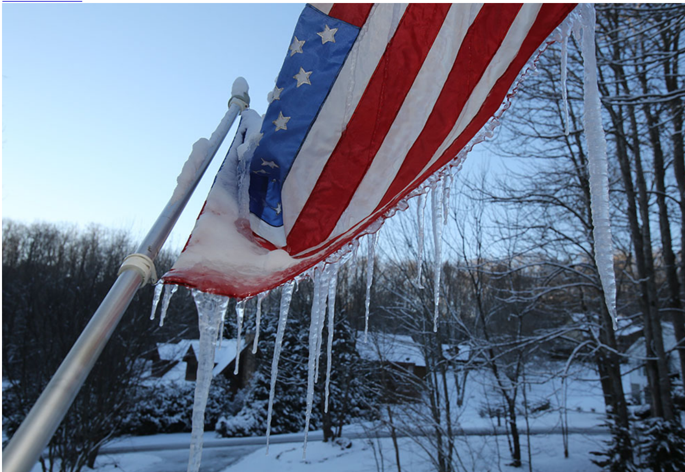
Icicles hang from a frozen U.S. flag on the front porch of a home in Waynesville, North Carolina, Dec. 26, 2020.