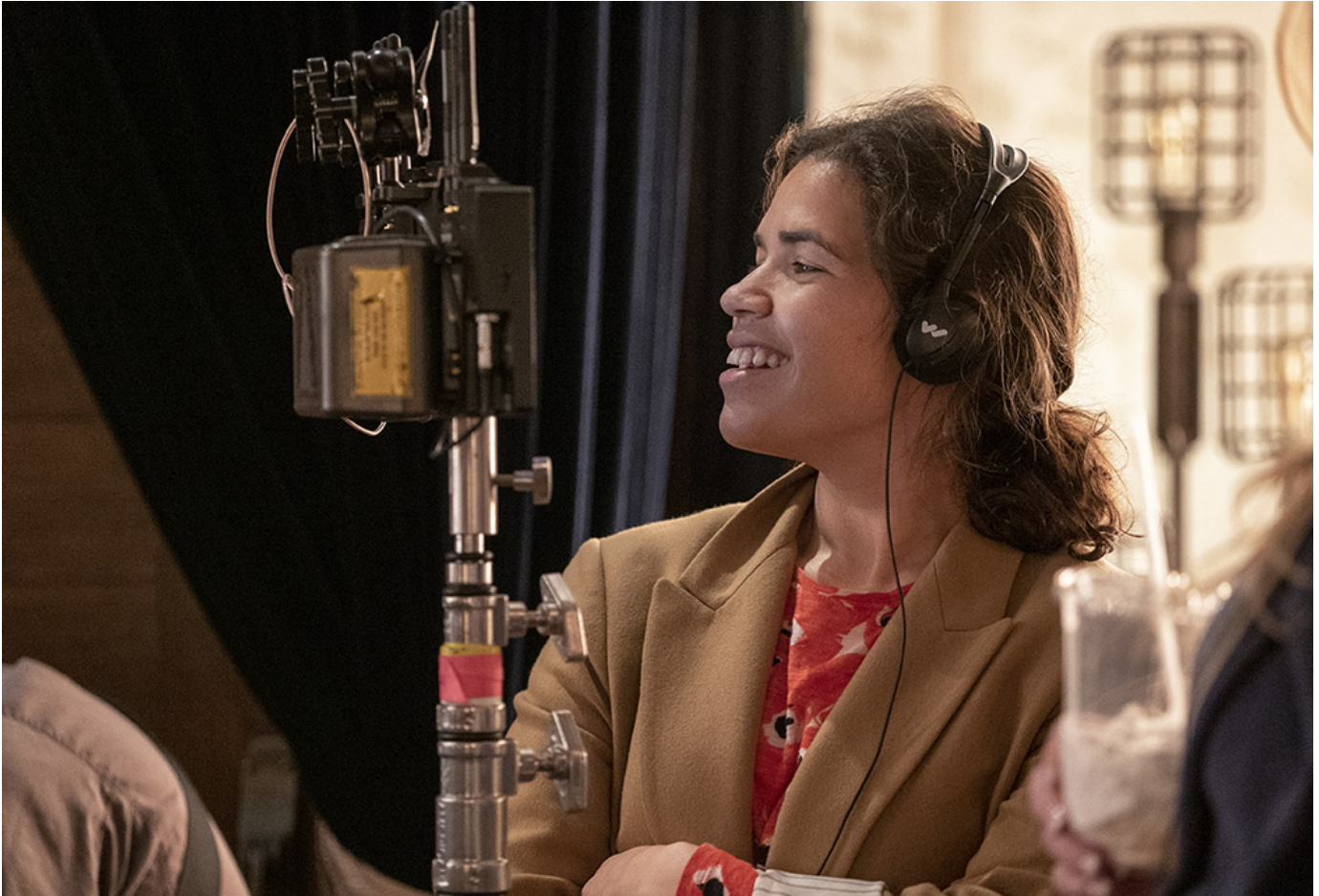
America Ferrera in a production still from "Gentefied"

Ferrera sees shows like "Gentefied" as an opportunity to showcase talented Latinx creators. After its cancellation, Ferrera wrote : "It's a small miracle and a monumental feat every time one of our stories is birthed into the world." With Netflix's latest insult to Latino communities, the existence of shows like "Gentefied" seem more miraculous than ever.