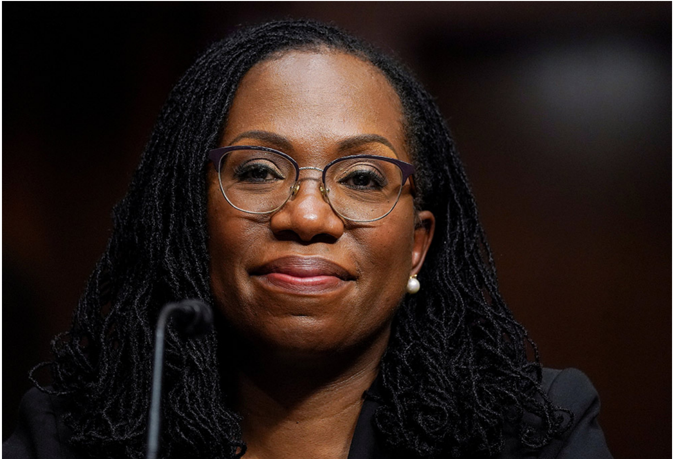
Ketanji Brown Jackson, pictured April 28, 2021, in Washington

Court watchers have been quick to point out that although her appointment would be historic, her spot on the bench will not change the court's current balance of liberal and conservative justices.