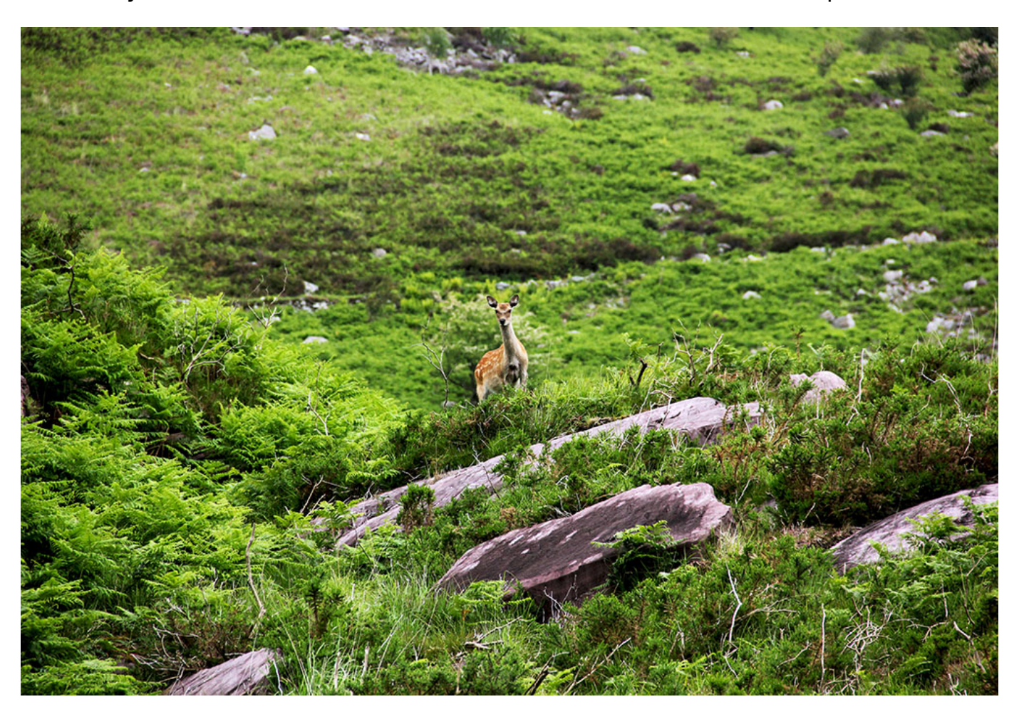
A doe deer in green grass at the Gap of Dunloe, Ireland

wrath of a tribal chieftain and his warriors. On the run, Patrick sang the Lorica — the Deer's Cry — and transformed his band into a herd of deer to avoid capture.