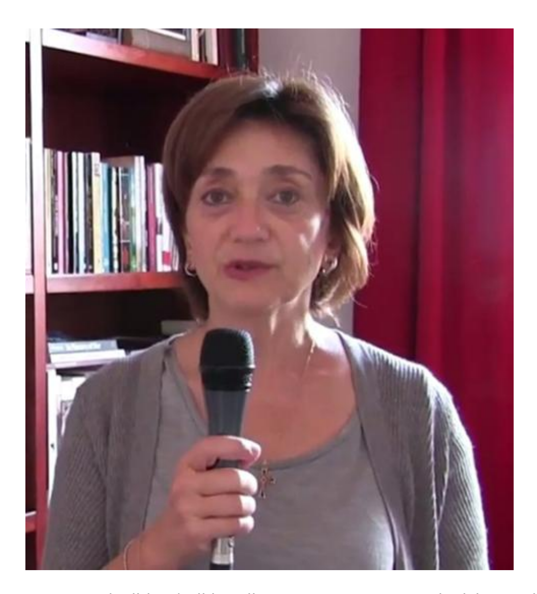
Tamar Grdzelidze

Former ambassador Grdzelidze said that she, too, "appreciated the Vatican's approach of never mentioning particular parties," but added that this stance allows the party or parties at fault to manipulate the Vatican's position.