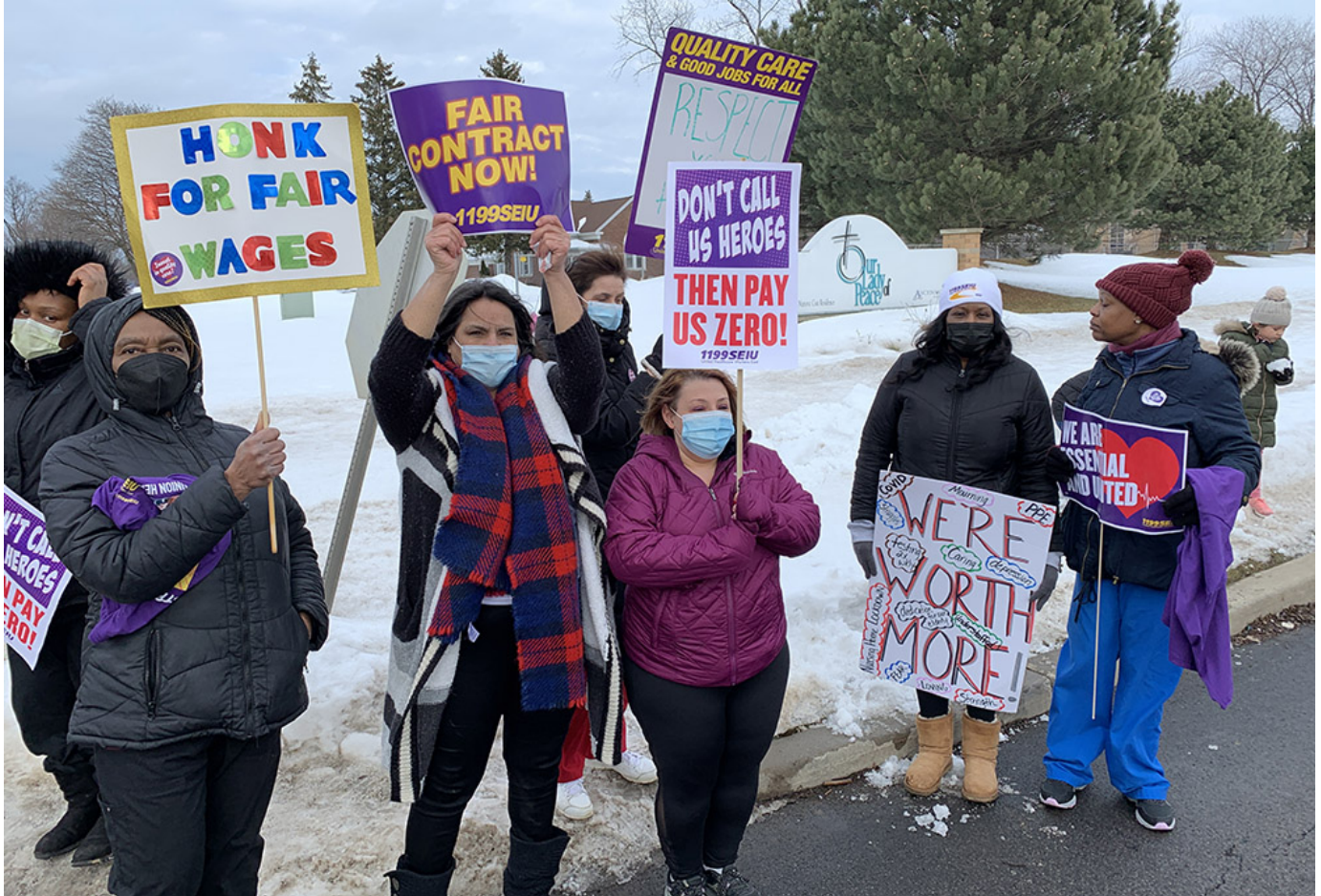
Ascension Living workers at our Lady of Peace hold signs during a one-day strike March 9 in Lewiston, New York