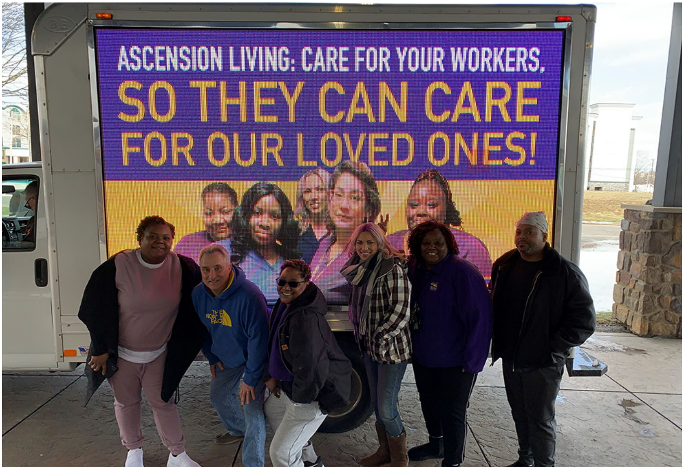
Ascension Living workers at Our Lady of Peace pose in front of a billboard.