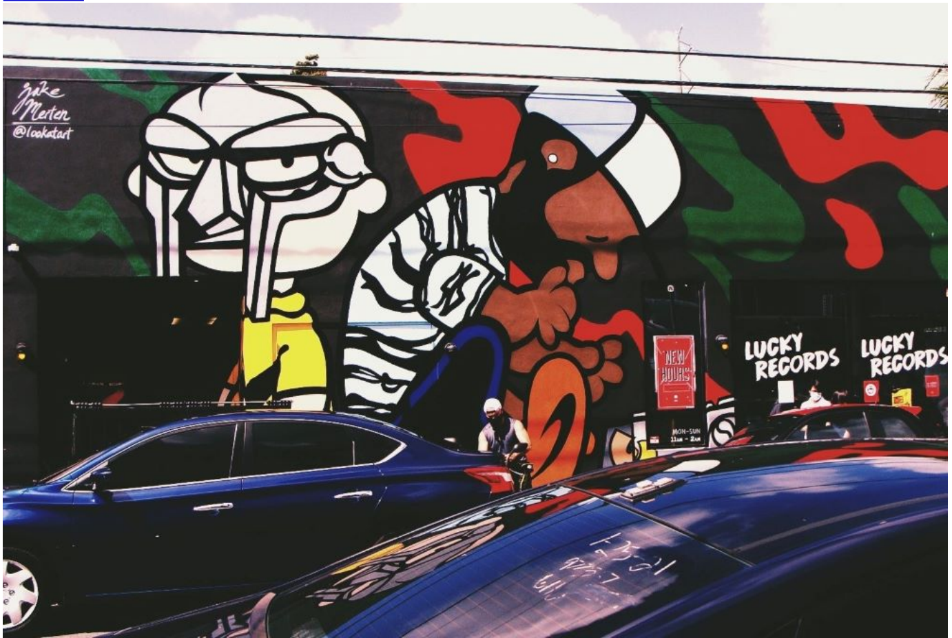
A mural of hip-hop artists J Dilla and MF Doom