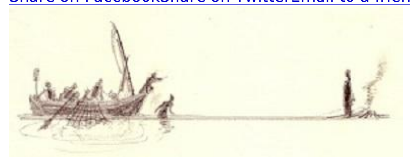
"Jesus revealed himself in this way" (John 21:1).

April 21, 2022 Share on FacebookShare on TwitterEmail to a friendPrint