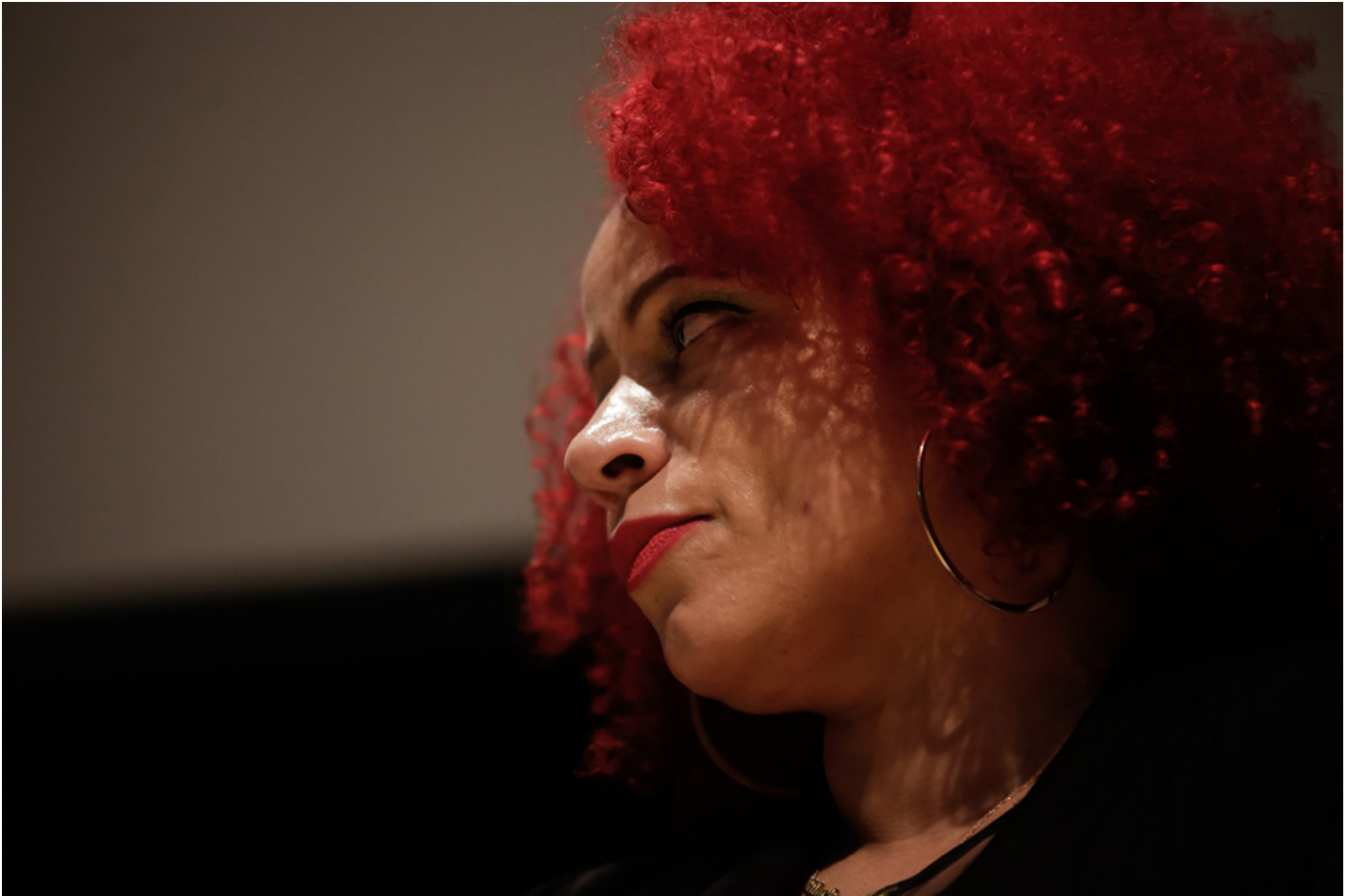
Nikole Hannah-Jones

The question for me provokes reflection, first, in a personal way on very basic realities that still are part of U.S. culture. I know that the presumptions that are packed into my understanding of how I will be perceived in countless situations and what I can take for granted day to day are not the same for my Black neighbors down the hall or in units above and below me in the condominium building where I live.