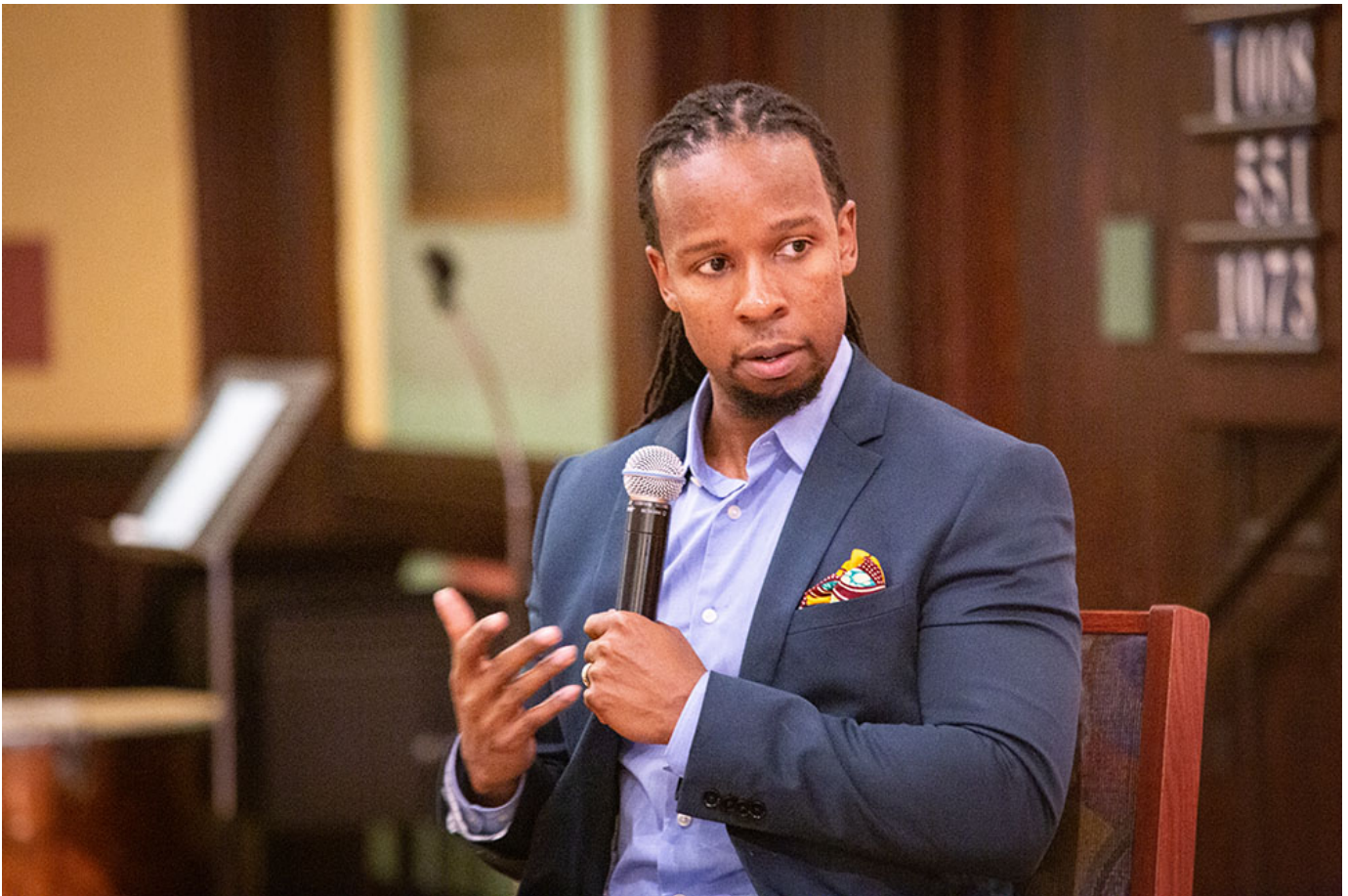
Ibram X. Kendi

In that personal instance, it might seem a bizarre declaration given the chaos and incompetence that followed him into the White House. In a much broader way, however, Ibram X. Kendi argues in the 1619 book that Obama "became" the version of "an American history popularly written as the story of incremental and steady racial progress."