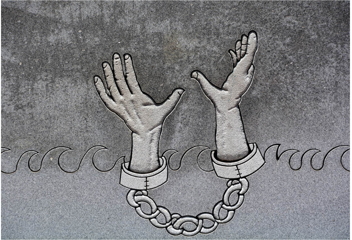
Detail of the African American Monument erected in 2002 in Savannah, Georgia