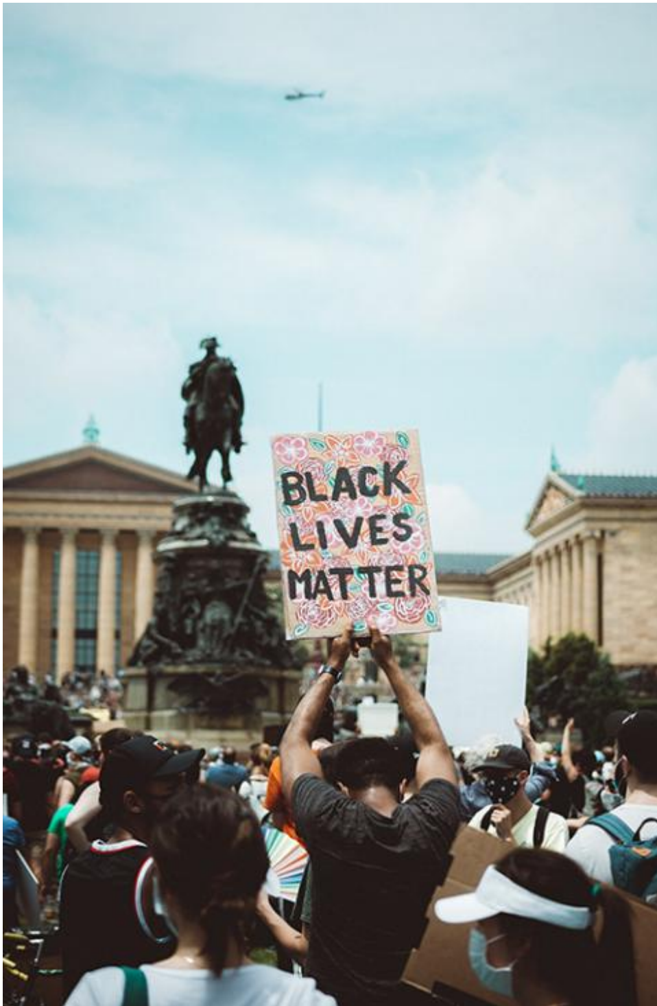
Philadelphia, June 2020

That last point seems especially the case, given the number of times in the book version that the Declaration of Independence and the Constitution are invoked by Black historic and contemporary figures as the rationale for continuing to fight for civil rights.