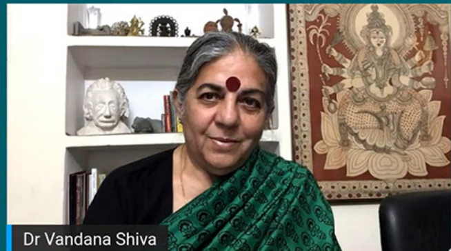
Dr Vandana Shiva