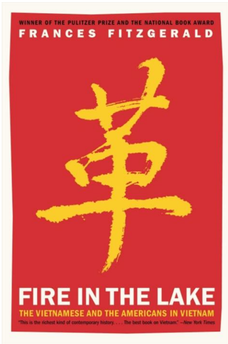
Cover of "Fire in the Lake" by Frances FitzGerald

Fire in the Lake — a book I remember as essential reading for anyone studying the war in college, as I did, in the late 1970s — was bafflingly left off a suggested reading for Ken Burns' PBS 2017 documentary on the war . Why? Apparently because