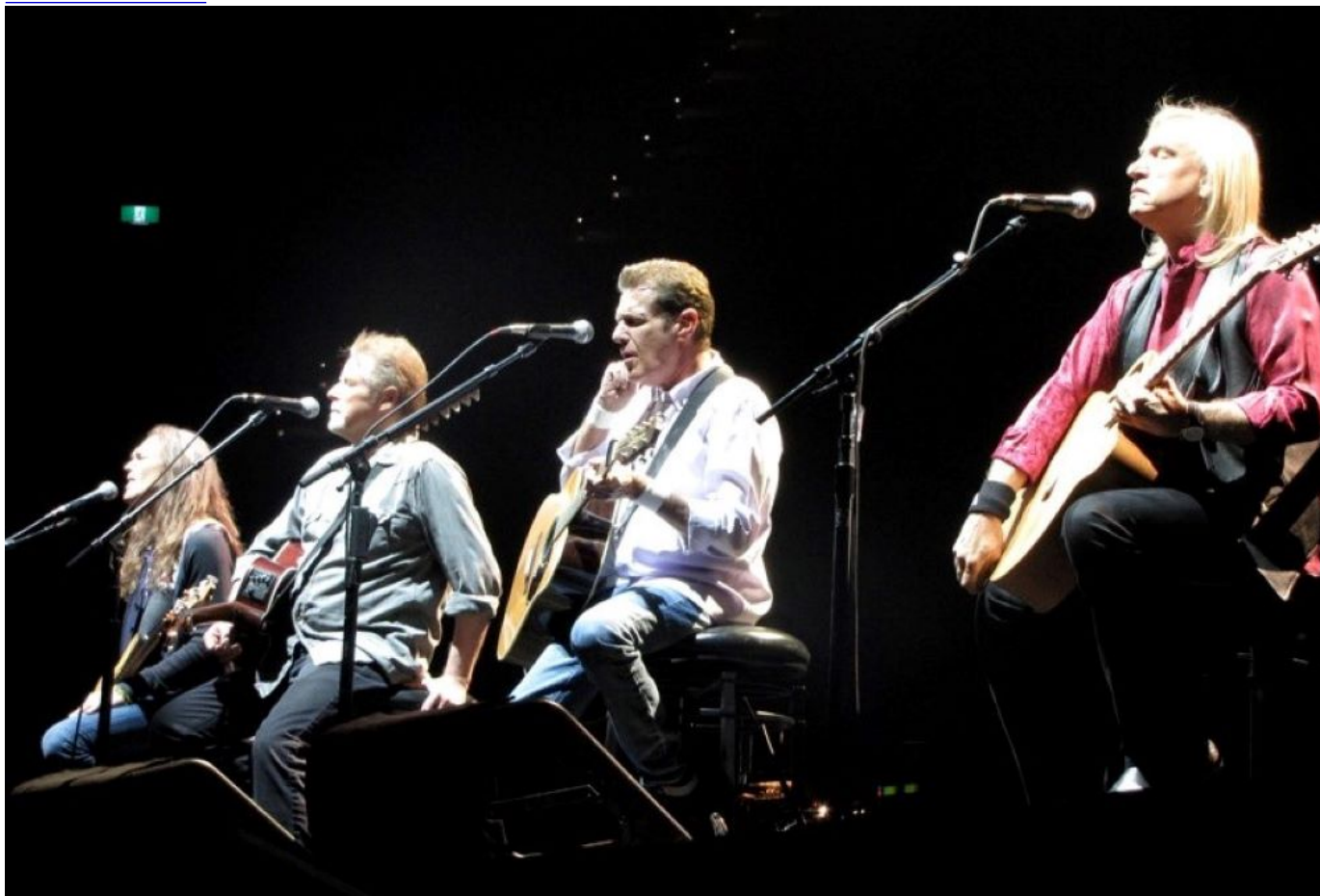
Eagles in concert Dec. 17, 2010, at Rod Laver Arena in Melbourne, Australia