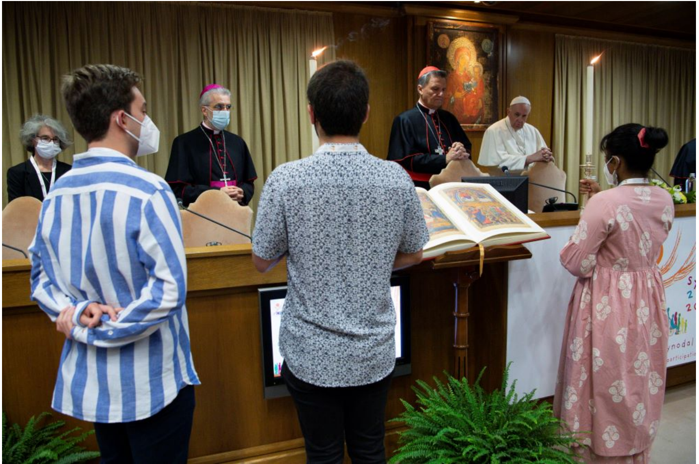
Pope Francis leads a meeting with cardinals, bishops, priests, religious and laypeople from around the world in the Synod Hall at the Vatican Oct. 9, 2021.

Authority in the church, in other words, is spiritual, and bottom-up. It rests on processes that discover the Spirit's will. It is to take seriously what Jesus promises in the Gospel of John: that the Spirit will guide us, strengthen us, teach us, bring us peace, so that we need not be fearful or anxious. We will have no need of authoritarianism, coercion and control, because it is not our power we rely on, but God's.