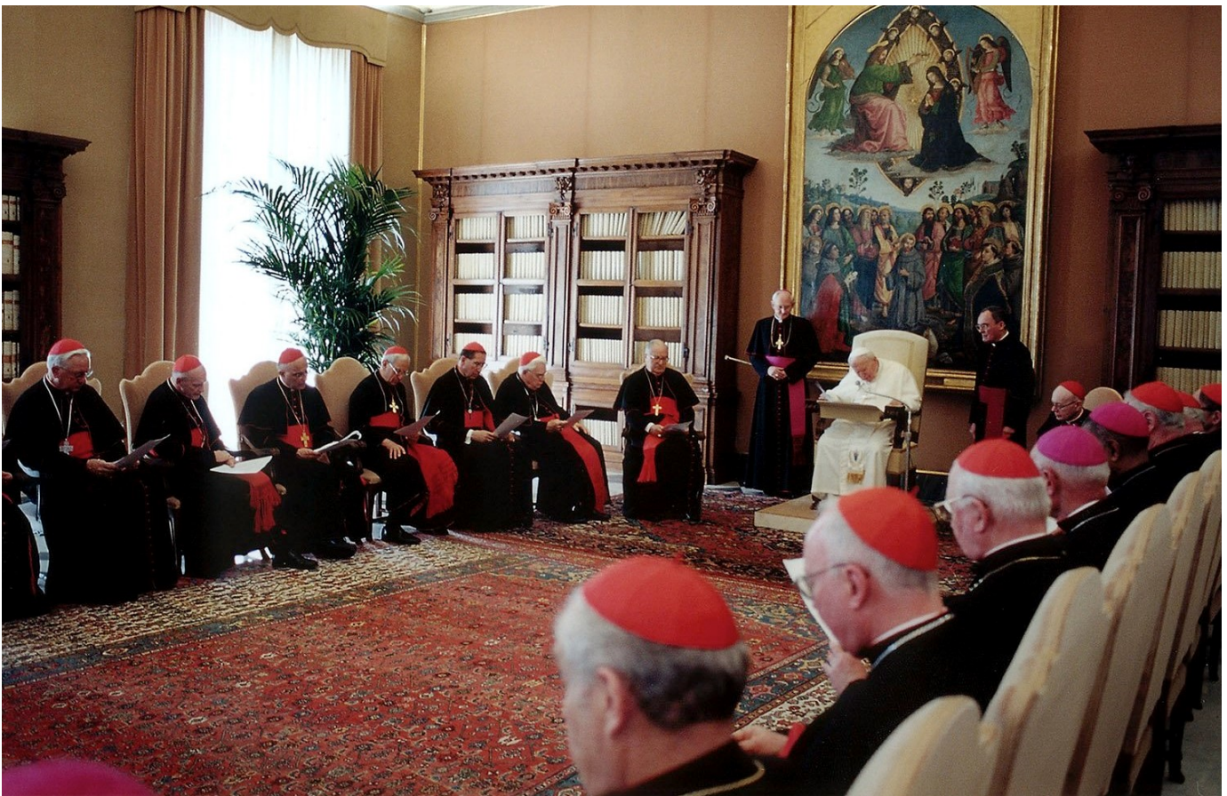
U.S. cardinals listen as Pope John Paul II addresses the special summit on clergy sexual abuse at the Vatican April 23, 2002. Cardinal Angelo Sodano, then Vatican secretary of state, is seated facing left of the pope.

Praedicate says clearly that the Curia "does not place itself between the Pope and the bishops, but is at the full service of both." Six articles (38-43) are dedicated to the ad limina visits, placing great importance on them, and stressing the role of the Curia in facilitating them, in encouragement and dialogue. This has long happened under Francis: Bishops who remember the old ways are astonished at dicasteries now asking, "how can we help?" and at the free-flowing two-hour meetings with the pope in which anything and everything is on the table. The meetings of religious with Francis are now so regular as not to be news.