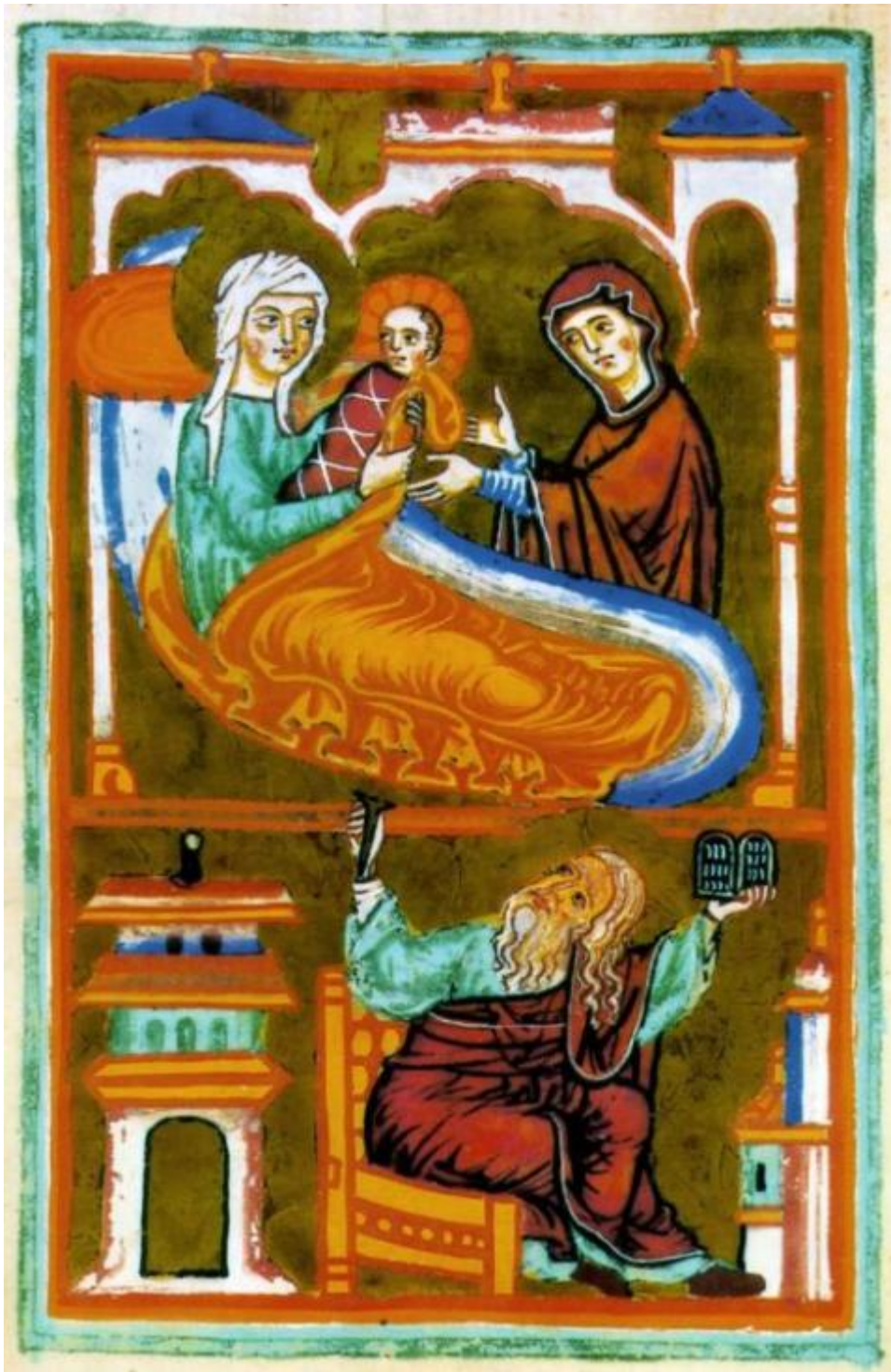
An icon depicts the birth of John the Baptist with his mother Elizabeth, father Zechariah, and Mary present.

The observance of Beltane, in early May, marked the opening of the pasture for grazing and honored Belenus, the Celtic god associated with the sun. For Beltane, all the fires were extinguished across the land. Then, the tribal chieftain lit the sacred