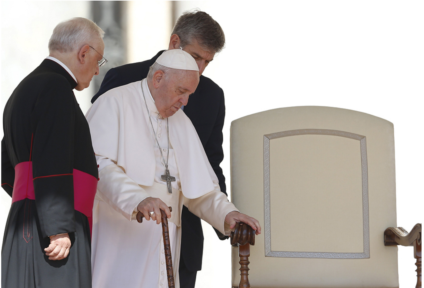
Pope Francis arrives at his chair during his general audience in St. Peter's Square June 8 at the Vatican.