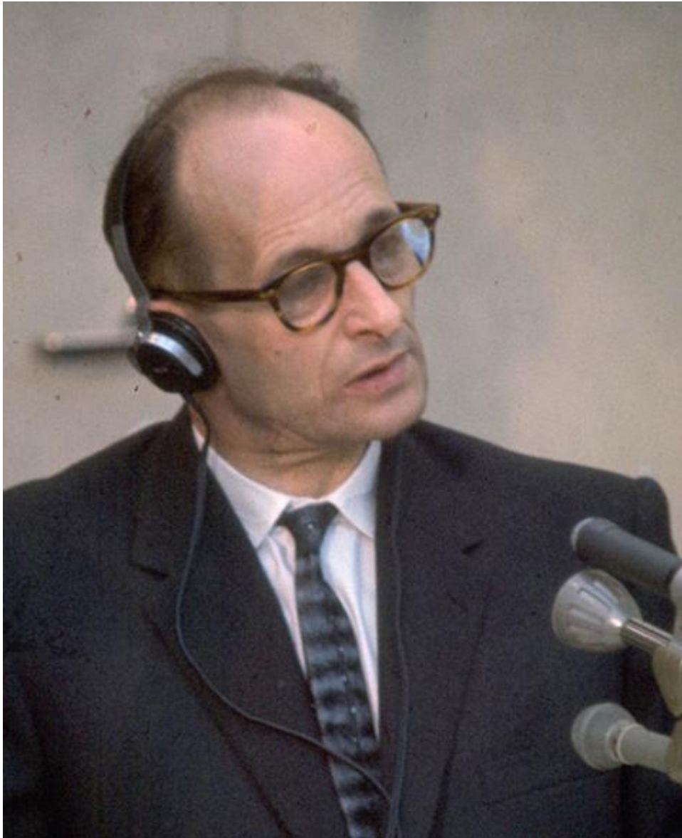
Adolf Eichmann on trial in Jerusalem in 1961

He then reflects on what the philosopher Hannah Arendt calls the "banality of evil" in her own reporting on and analysis of the Eichmann trial in her 1963 book Eichmann in Jerusalem .