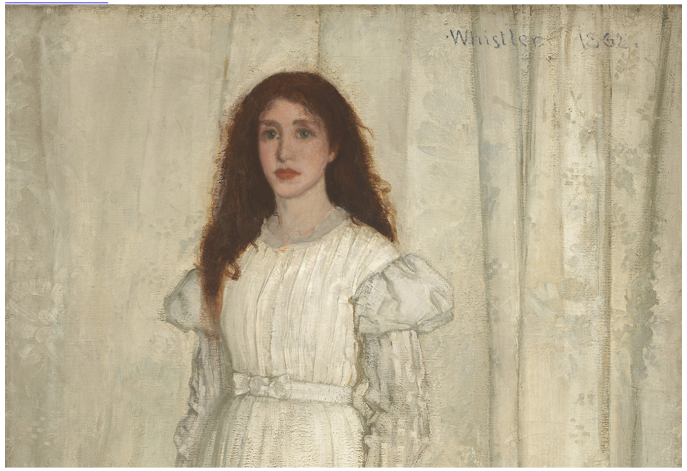
"Symphony in White, No. 1: The White Girl," 1861–1863, 1872, by James McNeill Whistler; see story below for full image