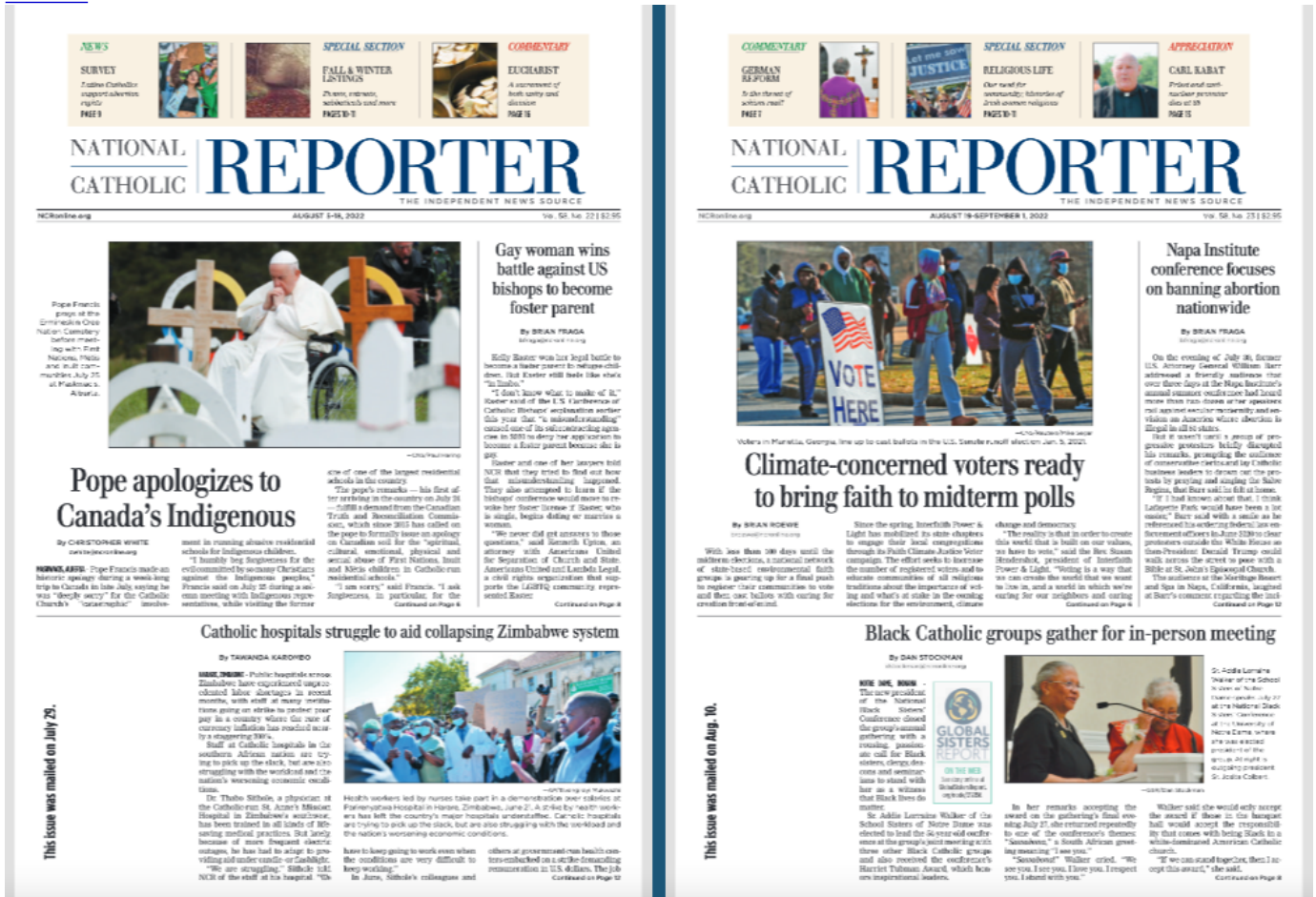
The front pages of two recent issues of the National Catholic Reporter (NCR graphic)