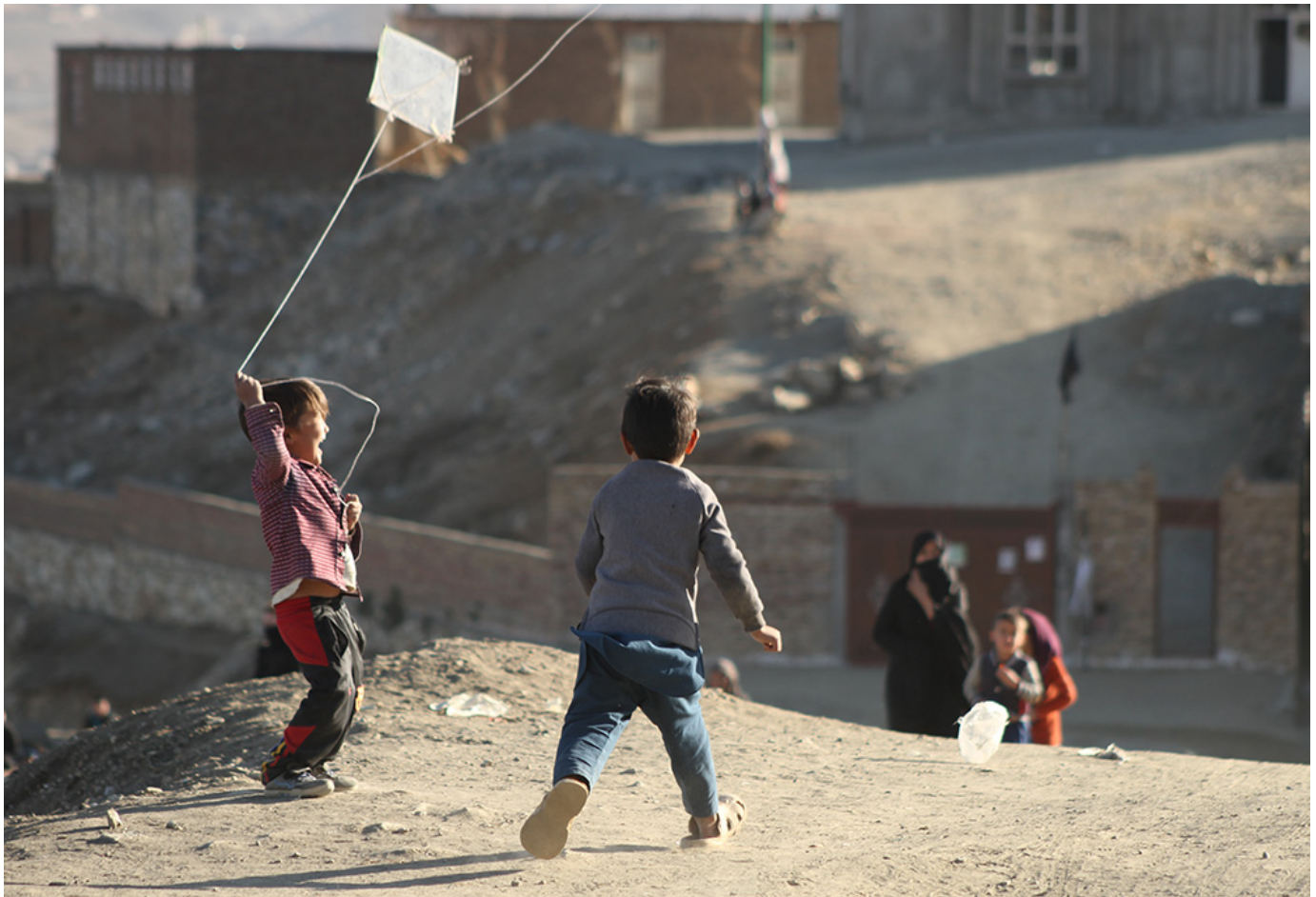
Children fly a kite in Afghanistan.

Even so, Afghans often felt looked down upon by the Americans. One governor of Kandahar province said a U.S.-led hand-washing humanitarian project was an "insult to the people. Here people wash their hands five times a day for prayers."