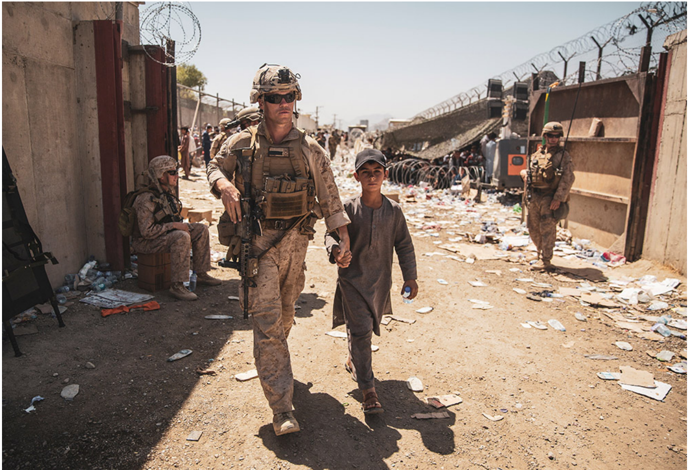
A U.S. Marine escorts a child to his family during an evacuation at Hamid Karzai International Airport Aug. 24, 2021, in Kabul, Afghanistan.

Was the enemy al-Qaida or the Taliban? How long would it take, long term, to claim ultimate victory? Could victory result from helping rebuild Afghanistan?