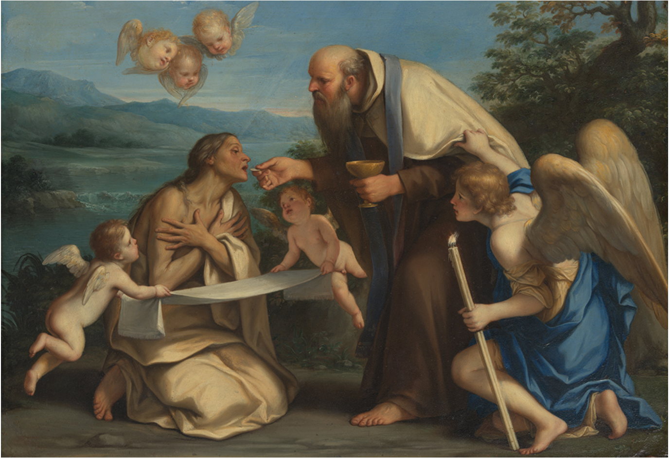
"The Last Communion of Saint Mary of Egypt," a 1680 painting by Marcantonio Franceschini (Metropolitan Museum of Art)