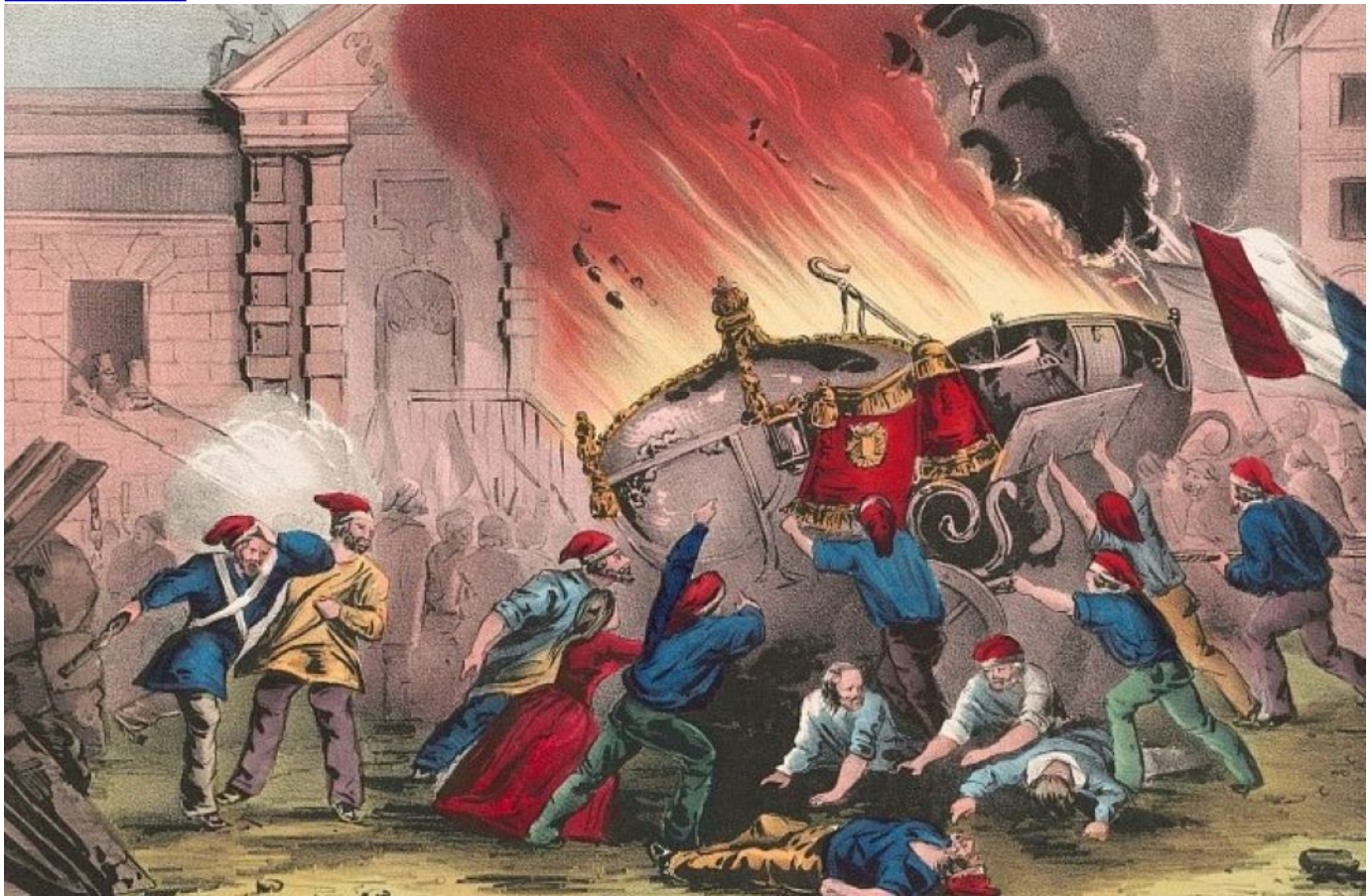
An image depicts burning royal carriages at the Chateau d'Eu during the French Revolution, c. 1848. (Library of Congress/N. Currier)