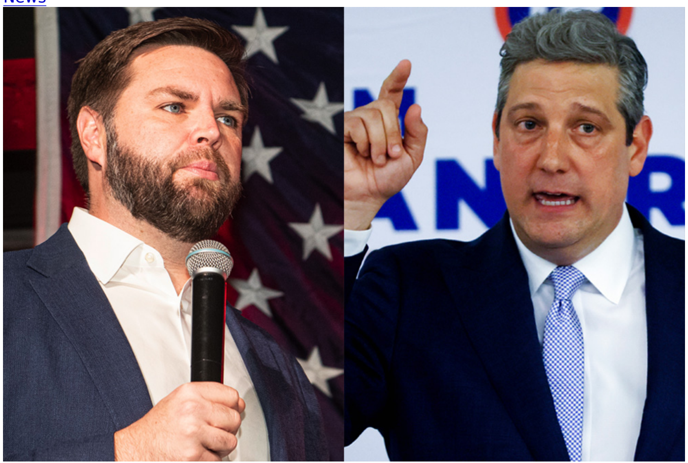
Left: J.D. Vance, Republican candidate for U.S. senator in Ohio, speaks at a campaign event in Medina, Ohio, Oct. 21. Right: Rep. Tim Ryan, D-Ohio, running for the open U.S. Senate seat in Ohio, speaks May 3 in Columbus.