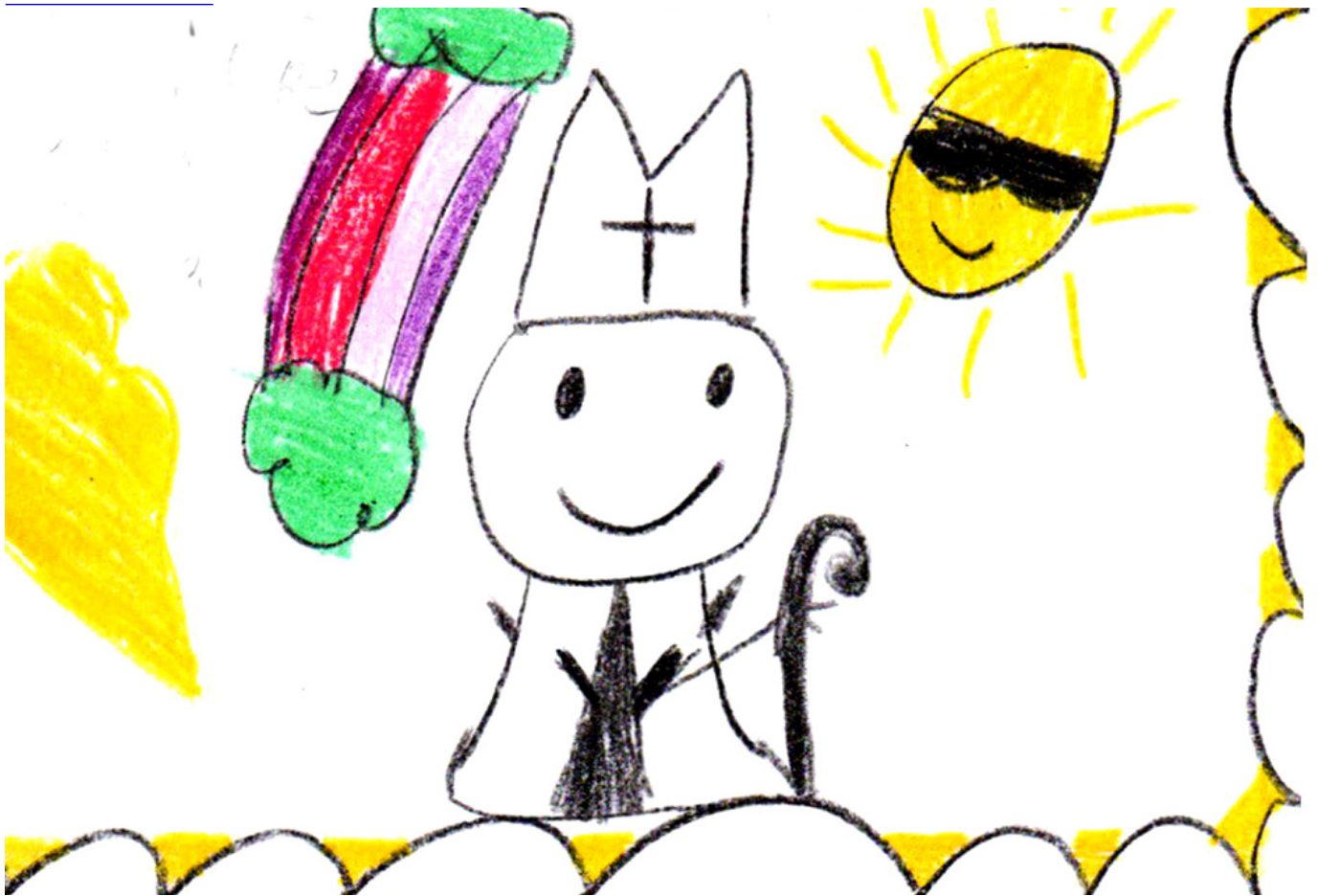
Artwork from a letter by a Robb Elementary student who wrote to Pope Francis