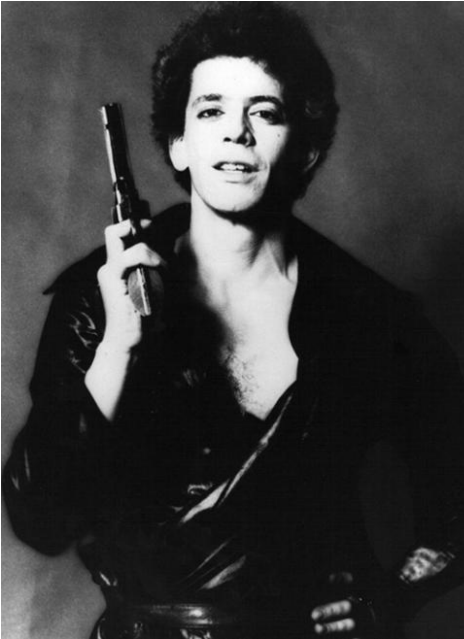
Lou Reed in 1977