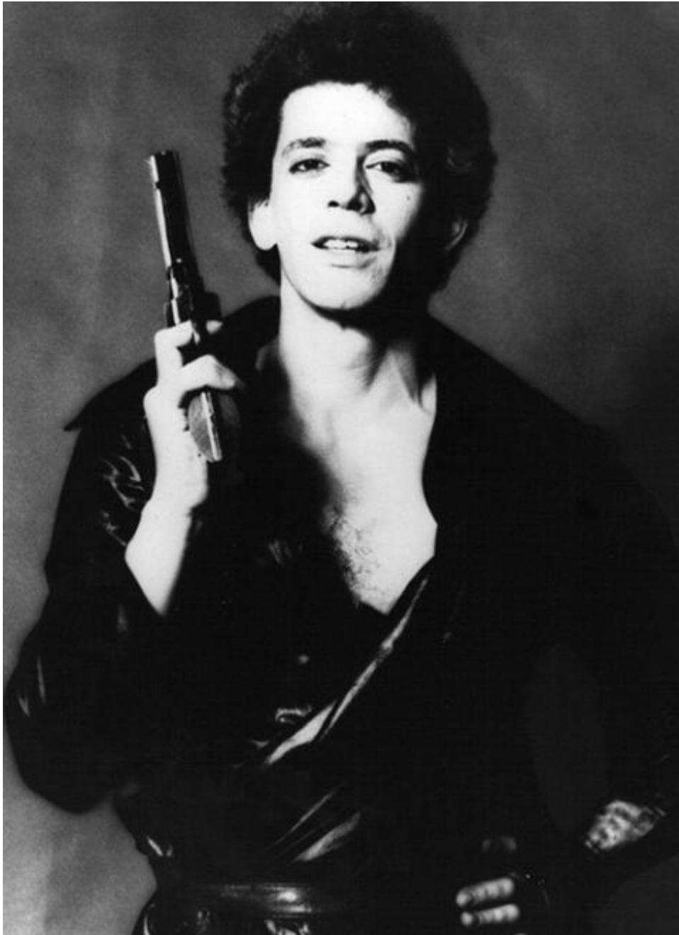
Lou Reed in 1977

New York had become queer wild after World War II. Returning queer soldiers moved to coastal cities, places big enough where you could disappear into the seams of society, and hope to find some other people who could see in you what they saw in themselves. And appreciate it.