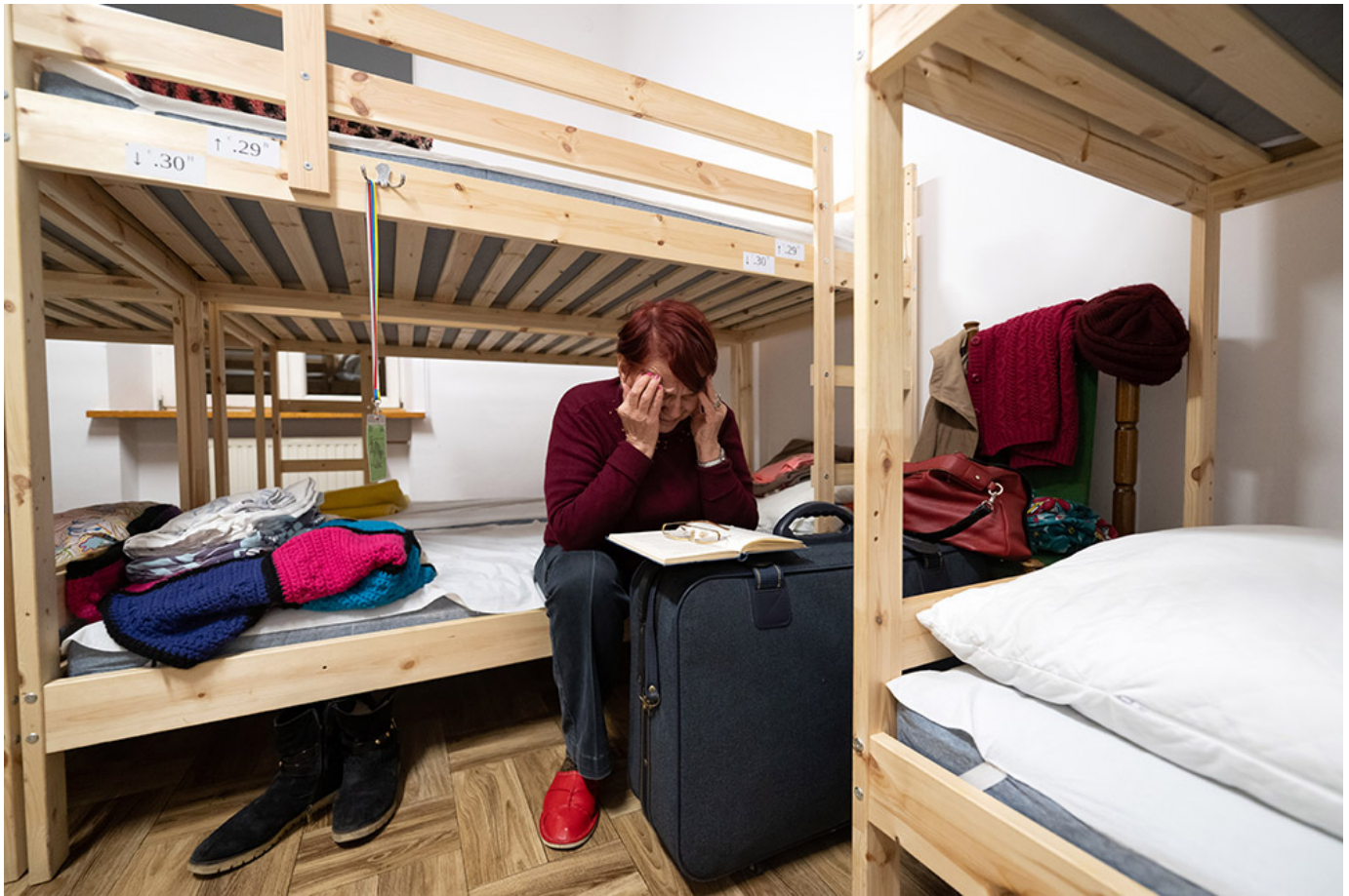
A refugee from Bucha, Ukraine, at the Greek Catholic Cathedral in Przemyśl, Poland, on Dec. 6