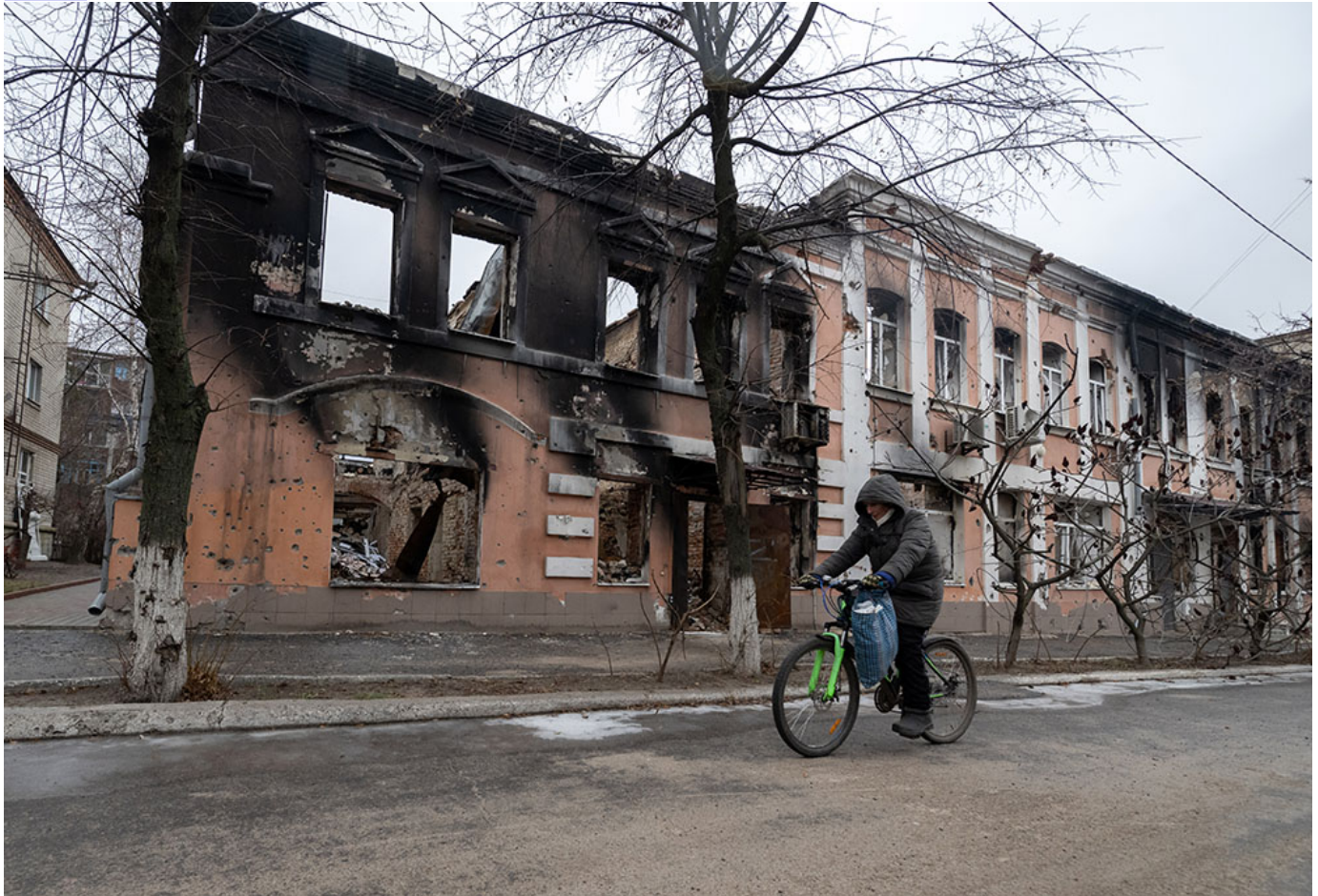
War destruction as seen in Izyum, Ukraine, on Dec. 8. (Marcin Mazur)