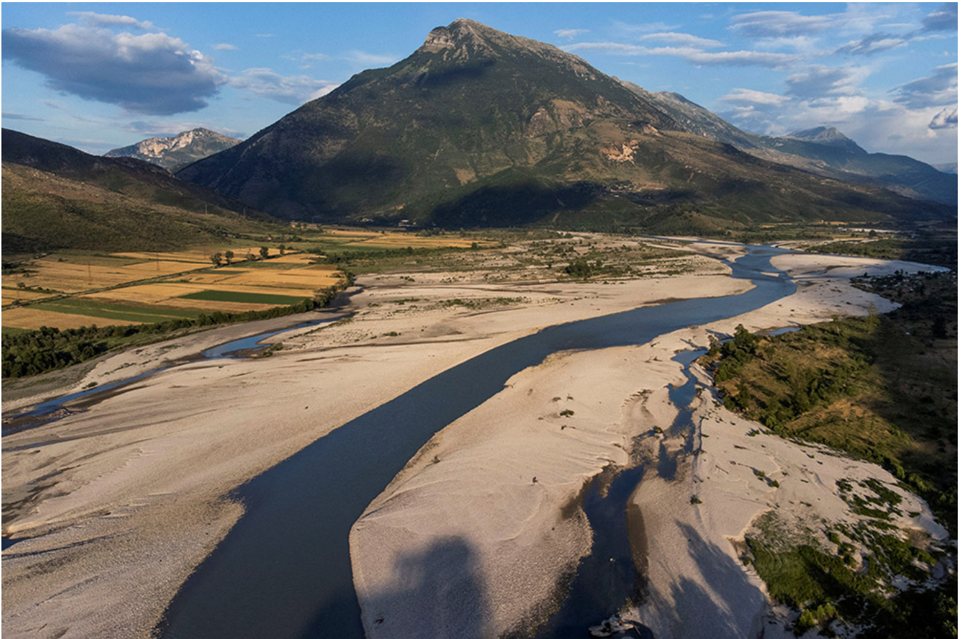
A general view shows Vjosa River in Tepelena, Albania, June 12.

Chief among the global targets is a commitment to set aside by 2030 at least 30% of the world's lands, oceans and inland waters for conservation, with a special focus on ecologically important areas. The goal would nearly double terrestrial areas under protection now (17%), and triple such marine areas (10%), according to the U.N. Convention on Biological Diversity , which facilitated the conference and negotiations.