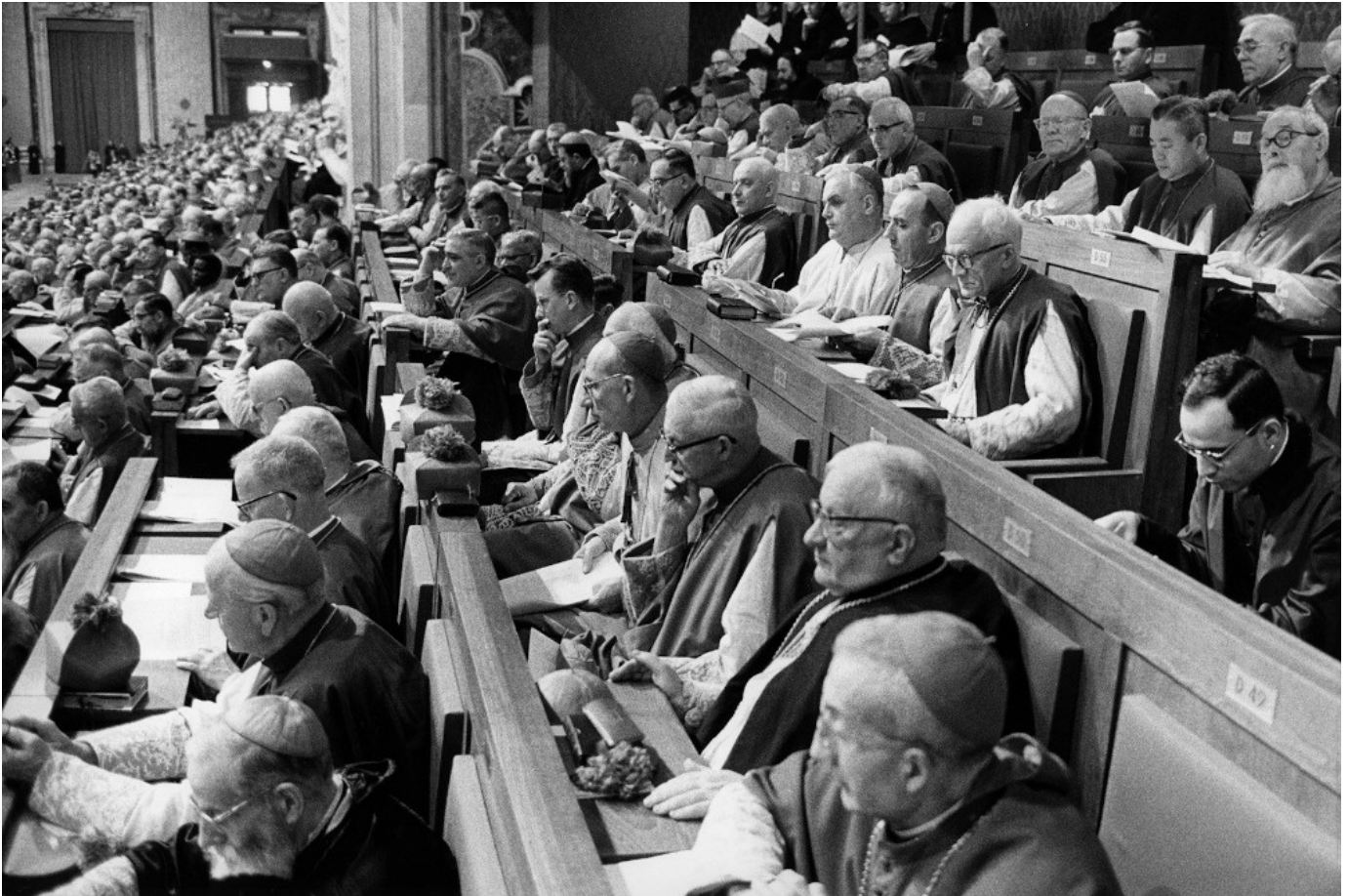
Bishops are pictured in a file photo during a Second Vatican Council session inside St. Peter's Basilica at the Vatican.