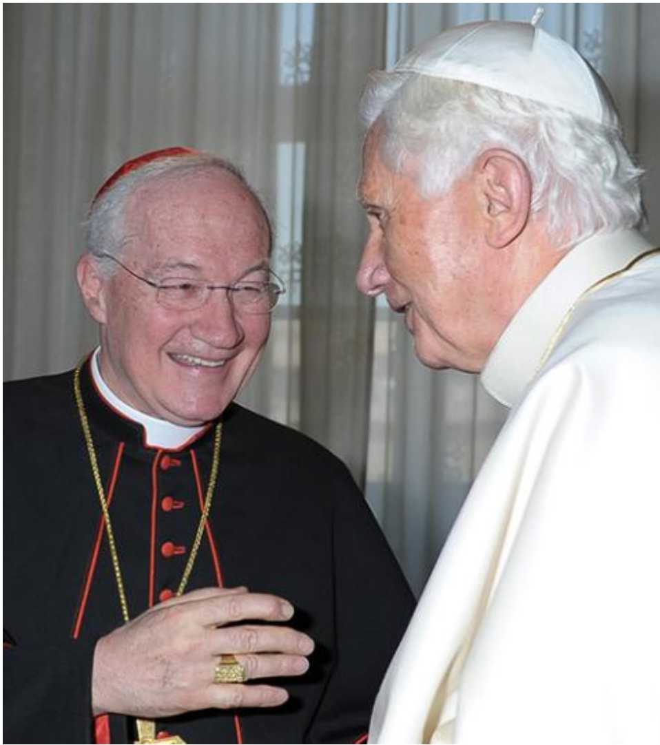
Cardinal Marc Ouellet with Pope Benedict XVI in 2011